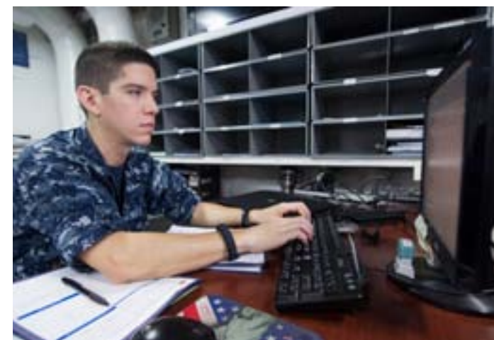
U.S. Navy Photo File

member words do not use a lot of bandwidth, but forwarding a long email thread can become a large file. Adding background pictures and images in the signatures also takes up space. By sending emails in plain text, you will help the email get on and off the ship sooner and more reliably.