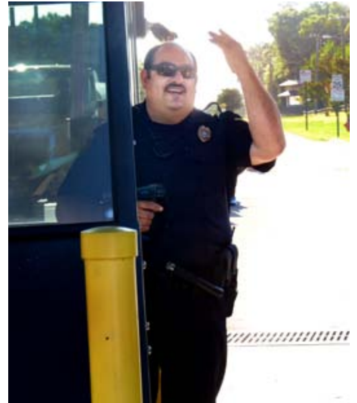
A NAS Whiting Field Security Officer motions for an approaching vehicle to proceed forward.