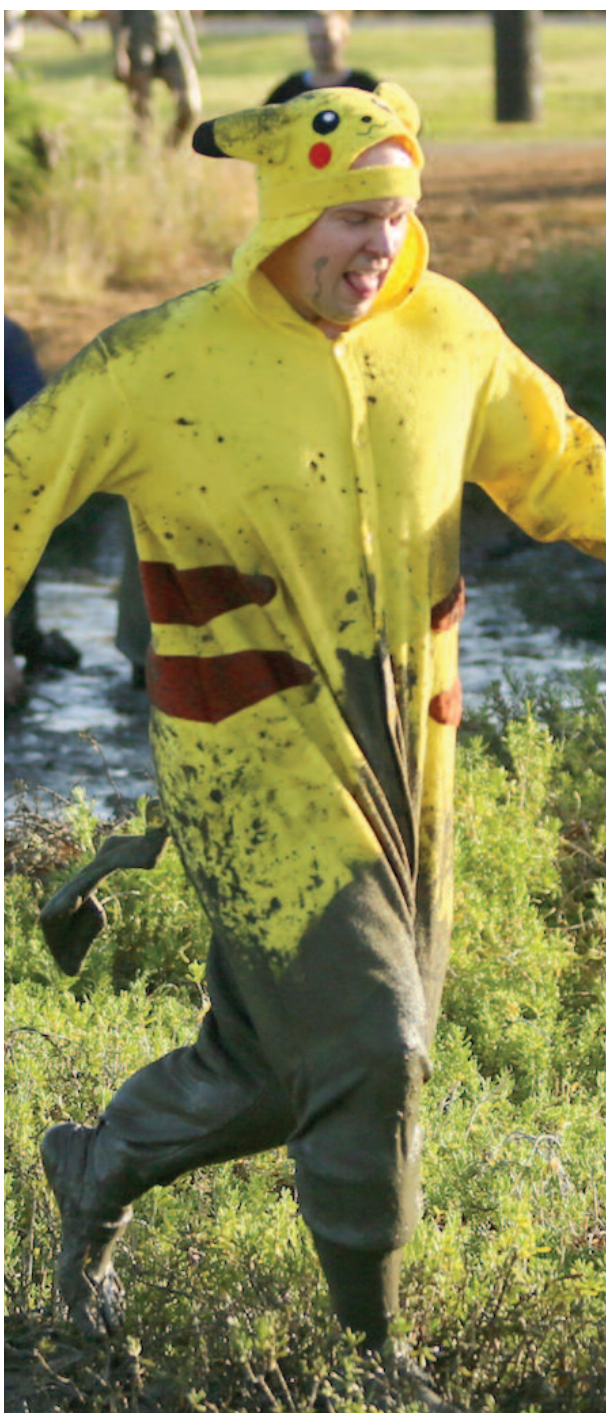
A man dressed up as "Pokemon" character Pikachu joined hundreds of participants in the event.