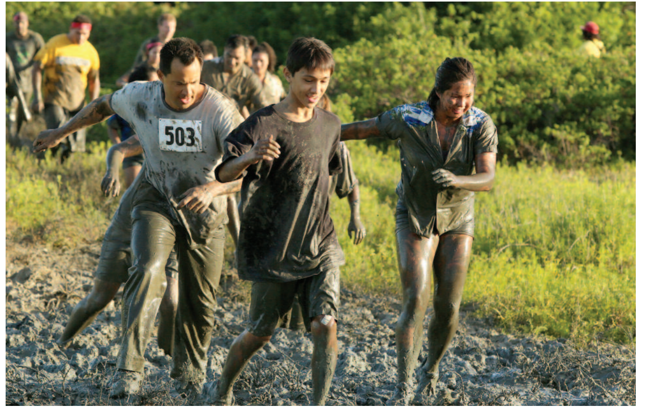
Participants run through Marine Corps Base Hawaii's 21st annual Swamp Romp held Feb. 7 at Landing Zone Boondocker.

The Beast, a 10-kilometer race, is on March 21. For more information on any of the races and to see results, visit mccshawaii.com.