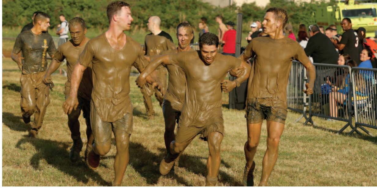
A team finishes Marine Corps Base Hawaii's Swamp Romp.