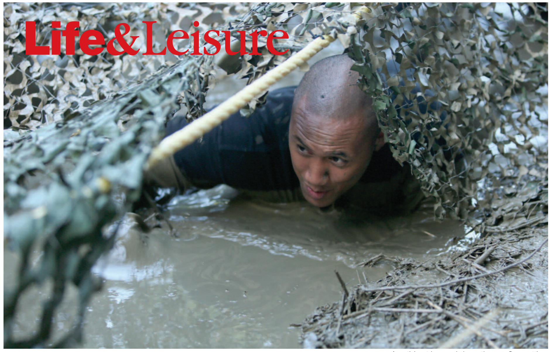
A participant low crawls beneath camouflage netting,