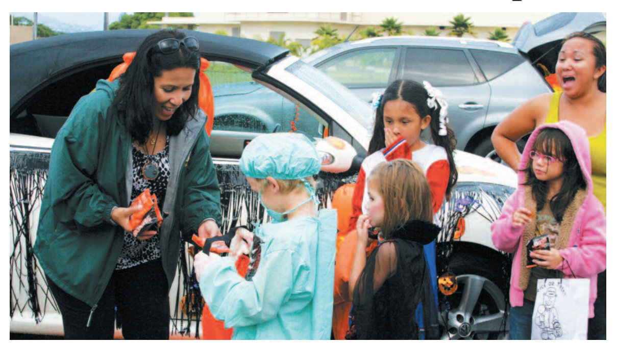
Trunk or treat gives adults and children a chance to dress up together for Halloween.