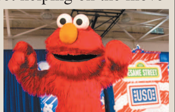
Elmo at the Sesame Street/USO Experience for Military Families to the Hickam Fitness Center.

About 2,500 parents and children attended all the shows. Long lines