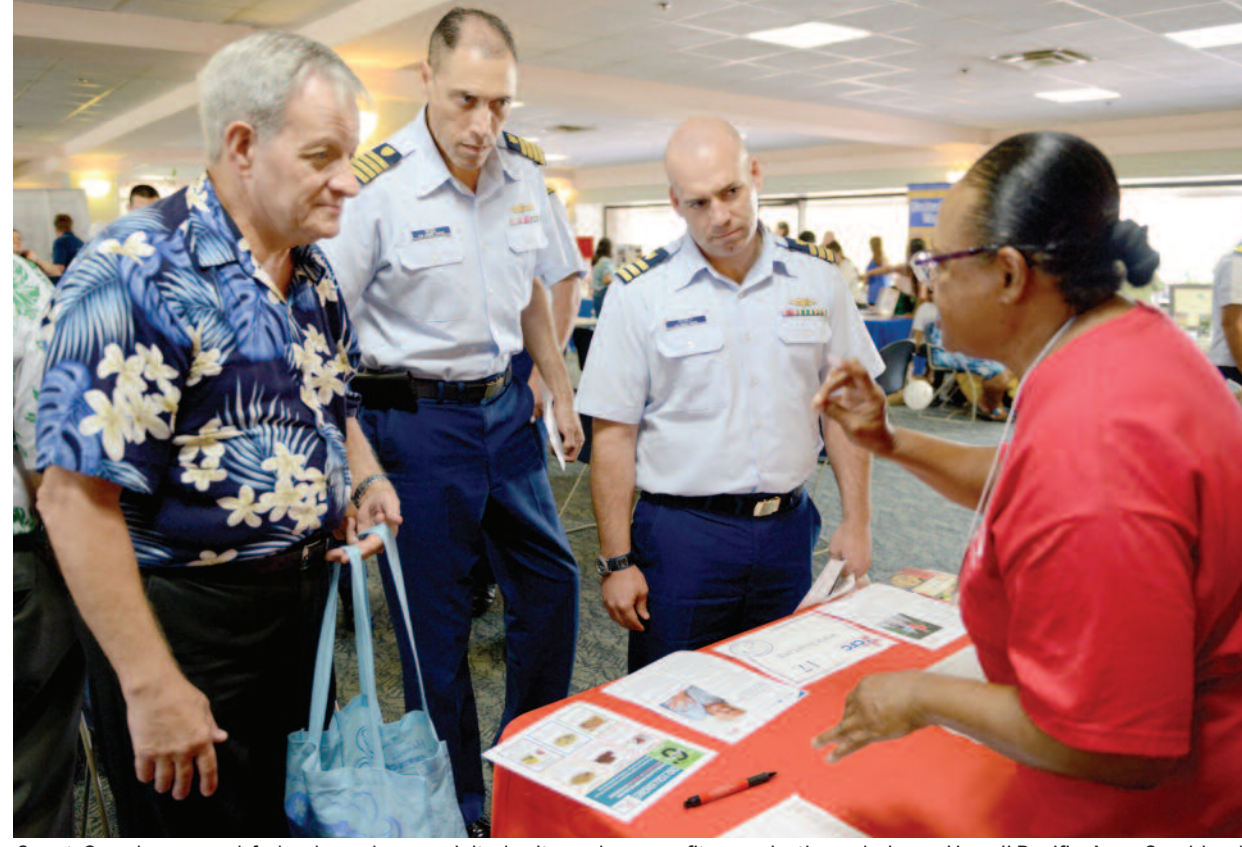
Coast Guardsmen and federal employees visit charity and non-profit organizations during a Hawaii-Pacific Area Combined Federal Campaign kickoff event at the Prince Jonah Kuhio Kalanianaole Federal Building in Honolulu, Sept. 21.