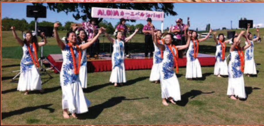
Nagaoka Aloha Club