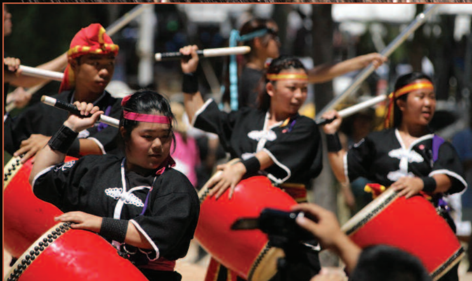
Ryukyukoku Matsuri Daiko Hawaii