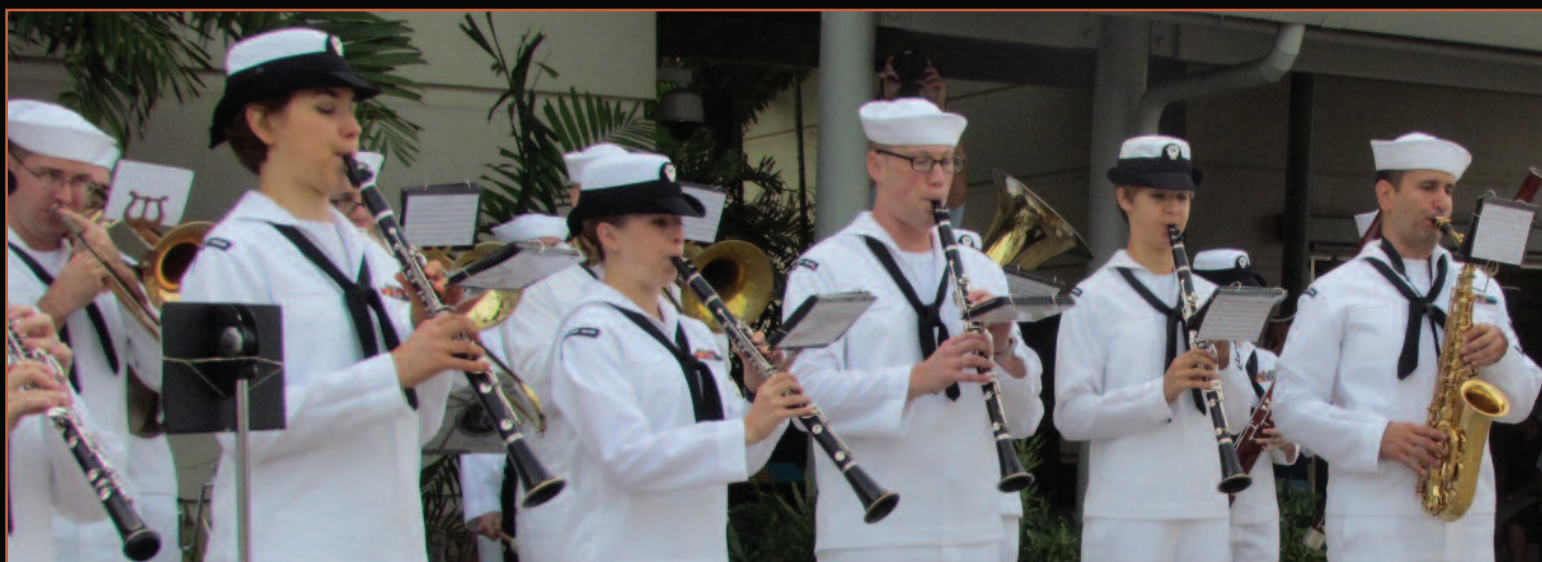
U.S. Pacific Fleet Band

For more information, visit the www.cnic.navy.mil/70yearsofpeace event website.