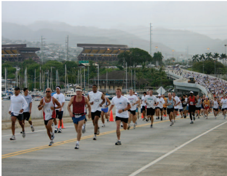
MWR Marketing photo

For more information, call the 10th Puka at 448-9890 or the Hapa Bar at 422-3002.