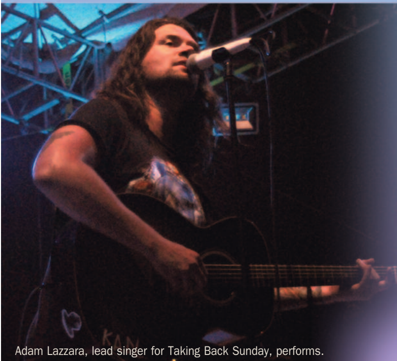
Adam Lazzara, lead singer for Taking Back Sunday, performs.