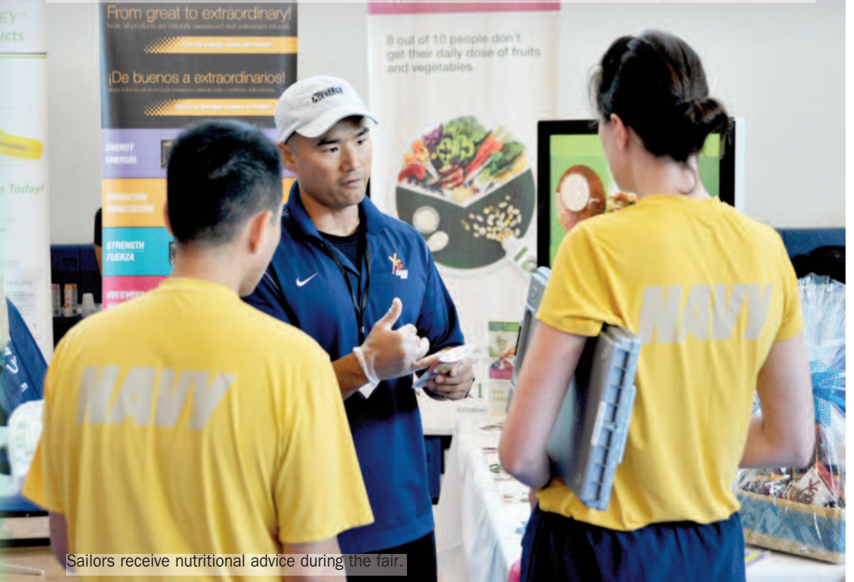
Sailors receive nutritional advice during the fair.