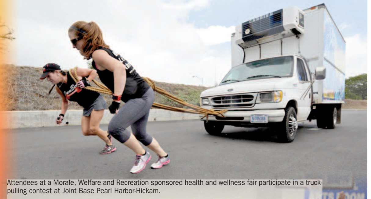
Attendees at a Morale, Welfare and Recreation sponsored health and wellness fair participate in a truck-pulling contest at Joint Base Pearl Harbor-Hickam.