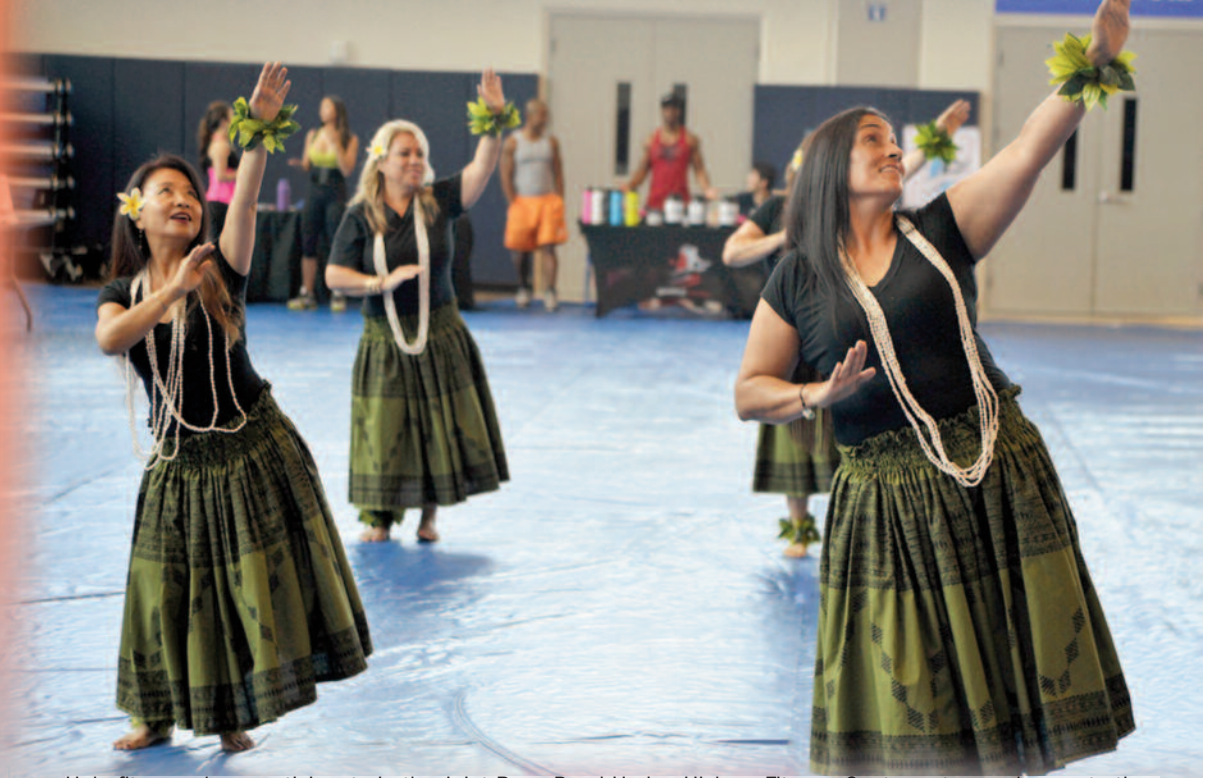
Hula fitness class participants in the Joint Base Pearl Harbor-Hickam Fitness Center put on a demonstration.