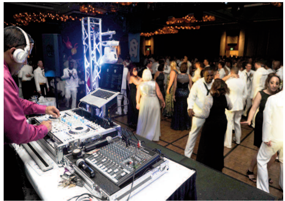
Sailors, their families and friends let loose on the dance floor at the 115th annual Navy Enlisted Submarine Birthday Ball held May 8 at the Hilton Hawaiian Village Hotel.

Submarine Ball events commemorate the anniversary of the U.S. Navy's submarine force. Since April 11, 1900, when the U.S. Navy first purchased John Holland's revolutionary submarine and dubbed it America's first commissioned submarine, USS Holland (SS-1), submariners have been patrolling the depths of oceans, providing maritime security around the world.