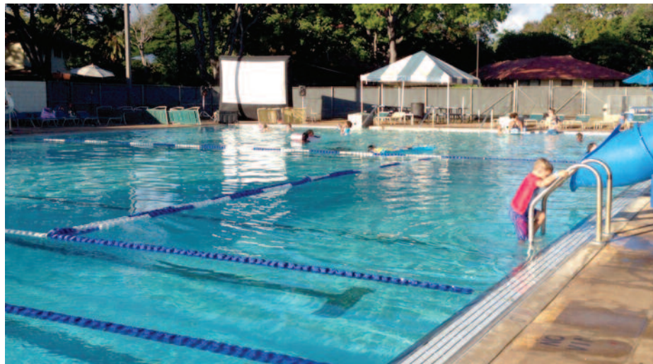
MWR Marketing photo

Dive-in movie nights will be held monthly at Hickam Pool 2, typically running April through August.