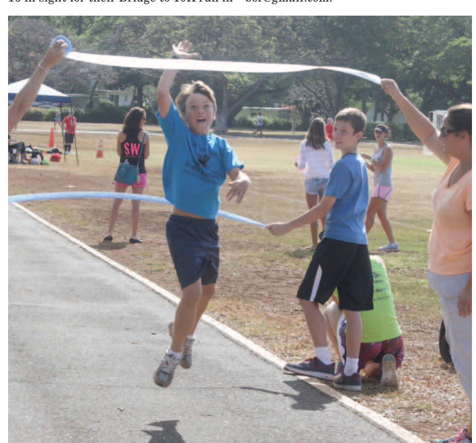
A youth jumps up for the finish line after completing his victory lap.