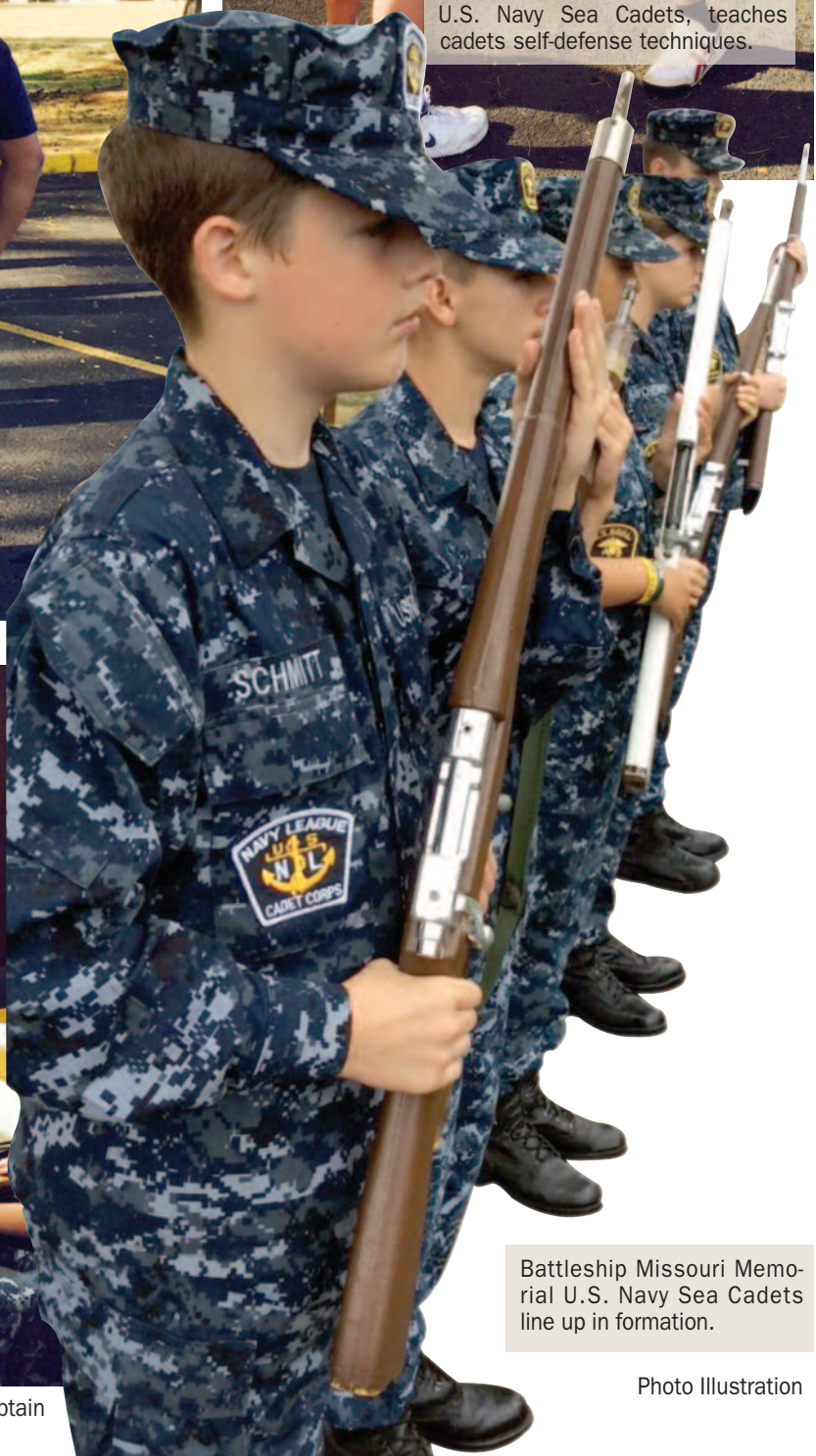
Battleship Missouri Memorial U.S. Navy Sea Cadets line up in formation.