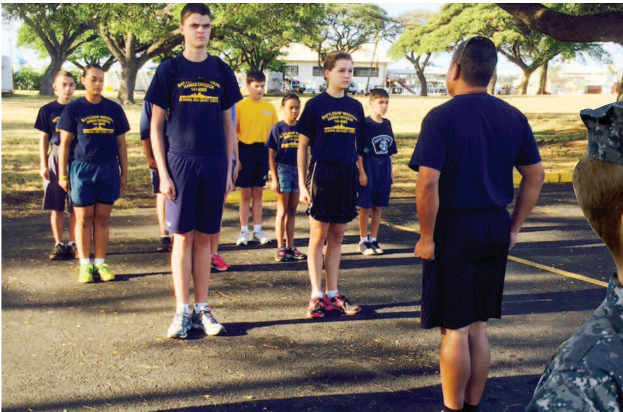
Sea Cadets fall into quarters for muster and instruction before physical training.