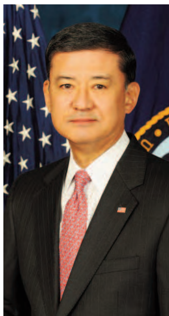
U.S. Secretary of Veterans Affairs Eric K. Shinseki