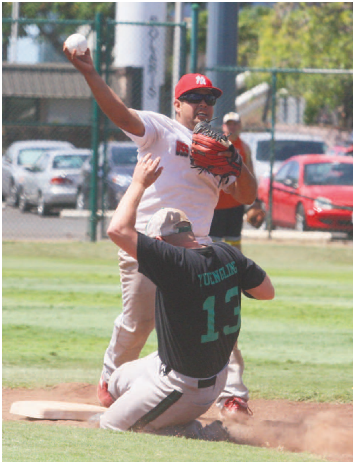
A player from USS Ronald Reagan (CVN 76) gets ready for a throw to first after a putout at second base during the team's championship showdown versus Navy Information Operations Command (NIOC) Hawaii in a 2010 Rim of the Pacific (RIMPAC) softball tournament at Millican Field, Joint Base Pearl Harbor-Hickam, on July 1. Reagan scored 23 runs in the first inning en route to a 25-1 victory over NIOC.

A total of 15 players stepped up to the plate