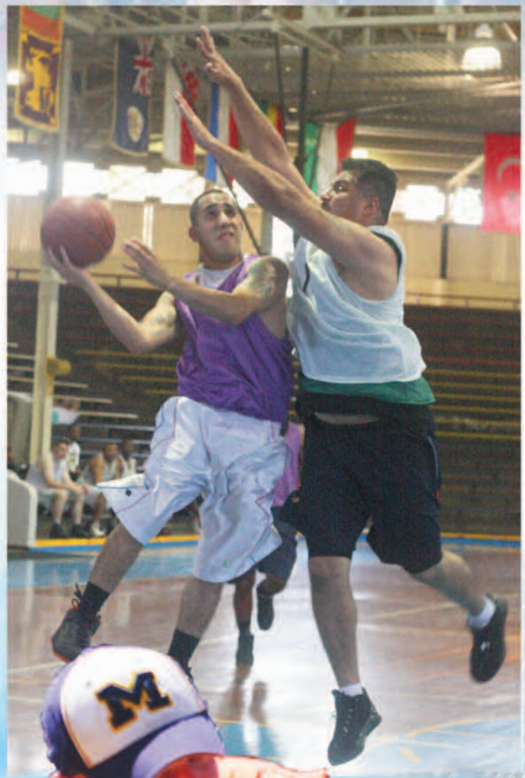
U.S. Navy photos by Randy Dela Cruz | Photo illustration