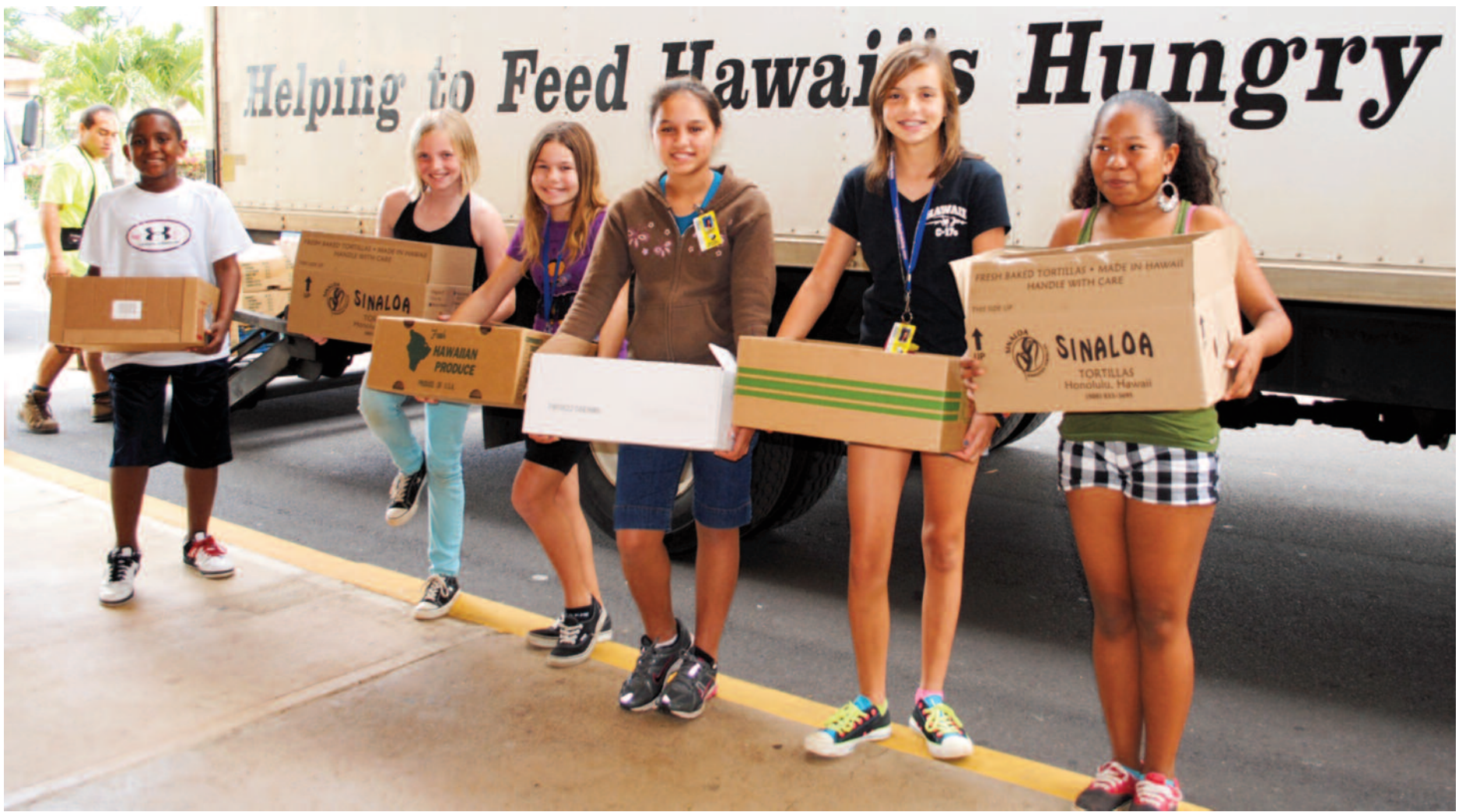
The Nimitz Elementary School Student Council hosted a canned food drive for the Hawaii Food Bank from Nov. 8-15.