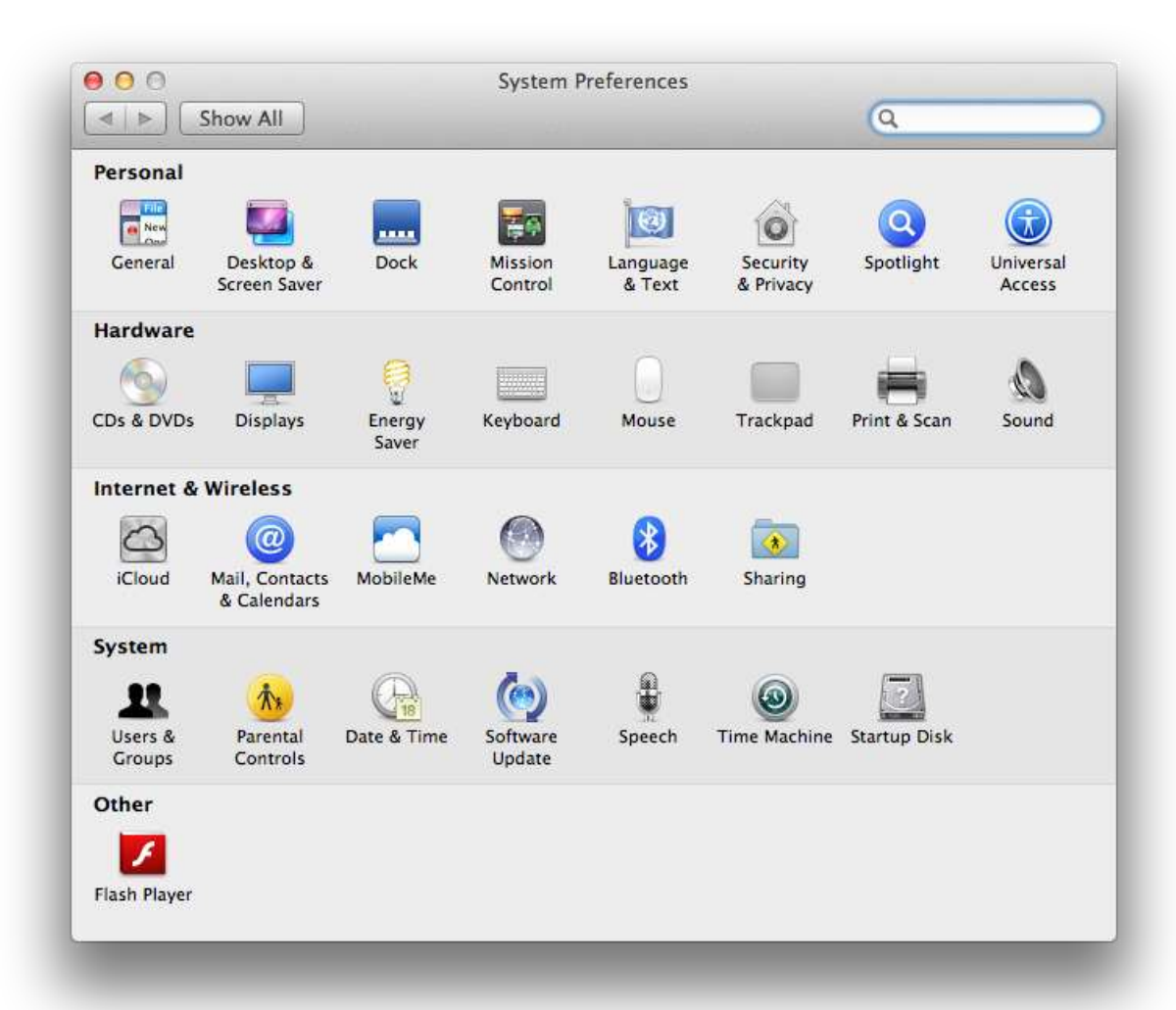
Open System Preferences and click on Network