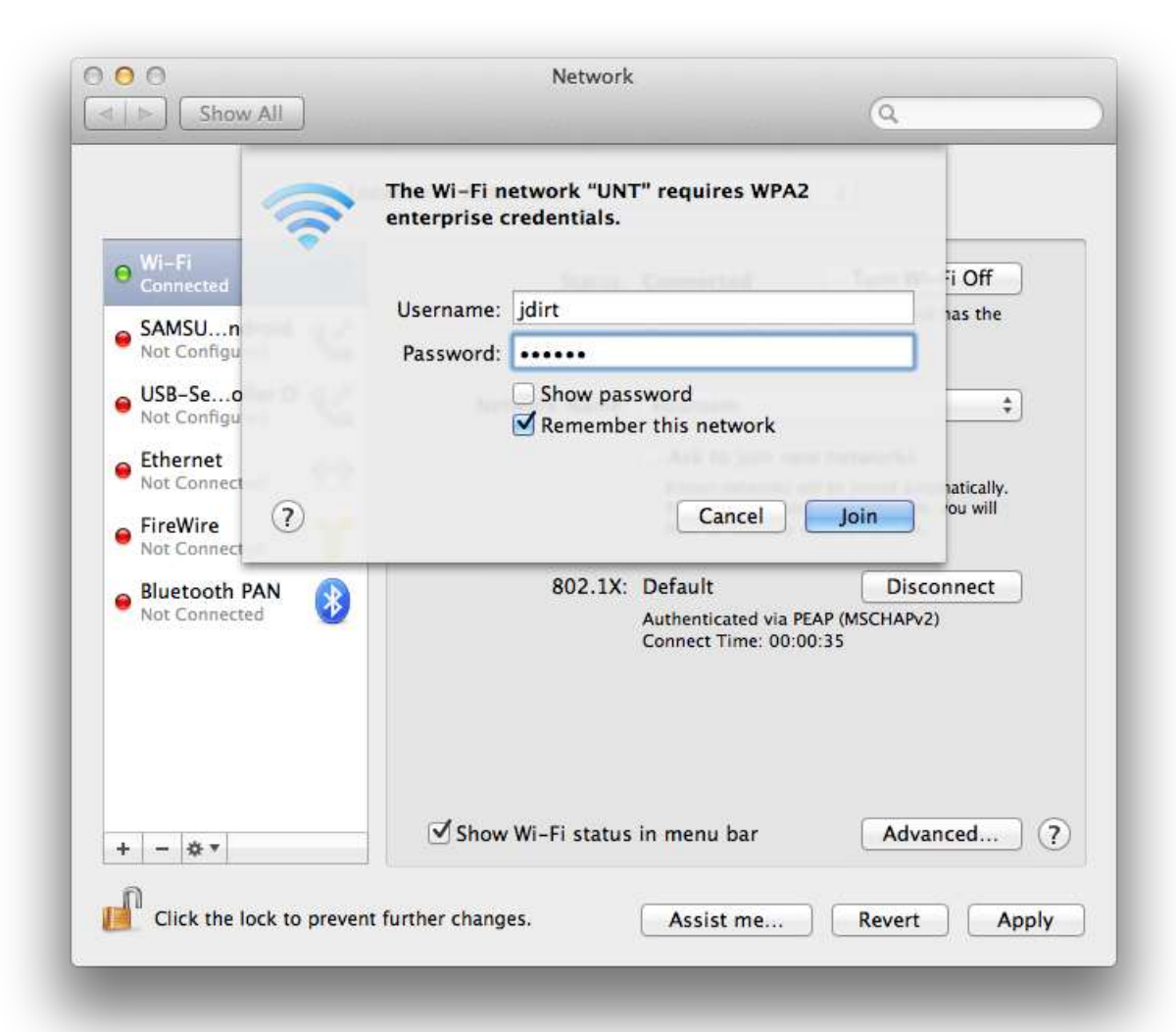
Enter your EUID and password

Check Remember this network then click the Join button