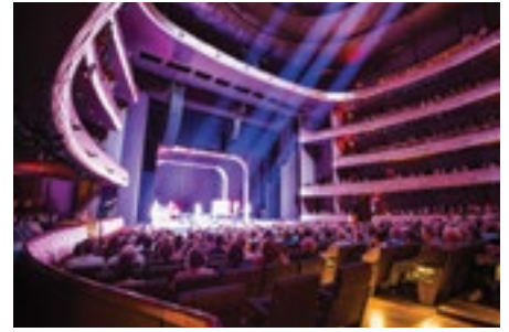
Winspear Opera House

Future plans include expansion to the historic Municipal Building.