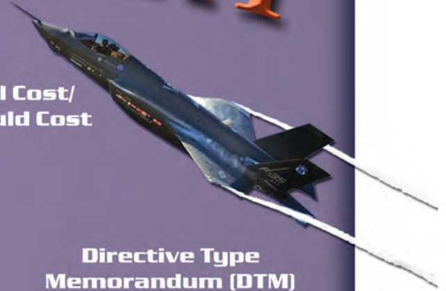
Directive Type Memorandum (DTM)