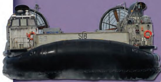
Critical Operational Issue (COI)/COI Criteria (COIC)