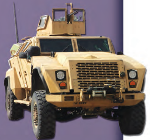
Weapon System Acquisition Reform Act (WSARA)