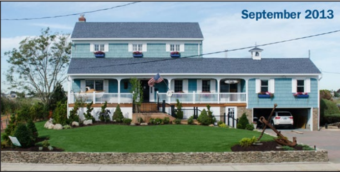
Figure 3: House elevated above BFE after Hurricane Sandy (Freeport, NY)