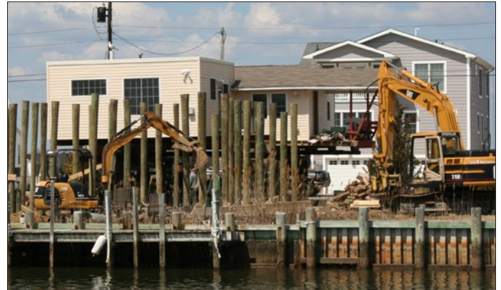
Figure 2: House being elevated on piles in Tuckerton, NJ