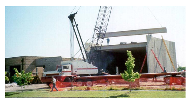
Community storm shelter being constructed to FEMA 361 criteria in Wichita, Kansas.

Buildings are designed to withstand a certain wind speed (termed "design [basic] wind speed") based