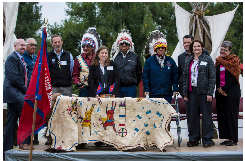
Oglala Sioux Tribal Leadership and FEMA dignitaries commemorate Federal Tribal Agreement signing