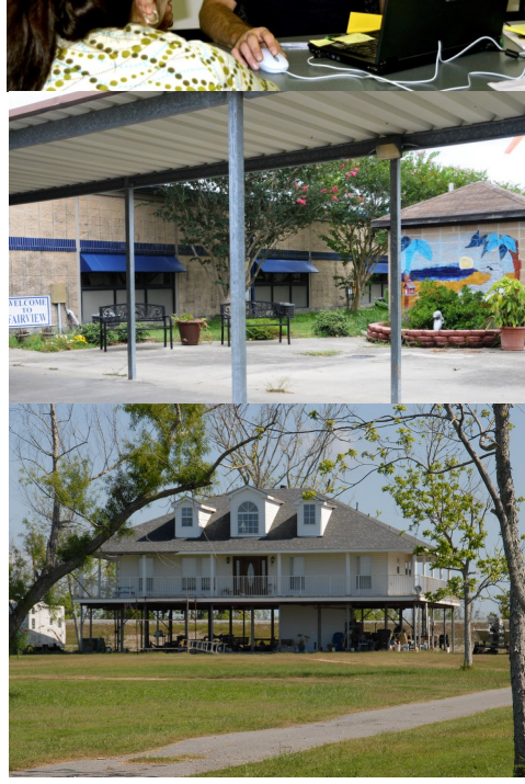
Recovery figures as of 5/1/2015 Mitigation figures as of 6/15/2015