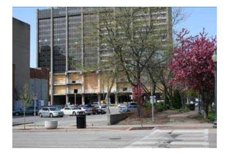
Photograph #3: View from intersection of 2<sup>nd</sup> Avenue and Cedar River Corridor Trail of the existing surface lot.