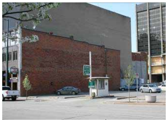
Photograph #2: View across 2<sup>nd</sup> Avenue showing existing entrance of Lot 24/26.