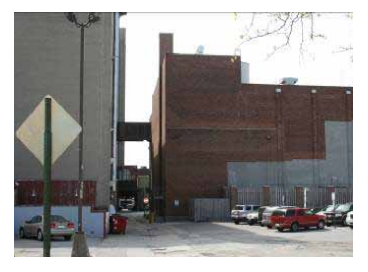
Photograph #8: View of alley through proposed project site to be built over from the Cedar River Corridor Trail.

Photograph #7: View from intersection of 2<sup>nd</sup> Avenue and Cedar River Corridor Trail to the east showing the parking lot for the Cedar Rapids Museum of Art.