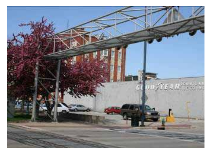
Photograph #4: View from intersection of 2<sup>nd</sup> Avenue and Cedar River Corridor Trail of railroad adjacent to the Trail, northeast of the proposed project site.