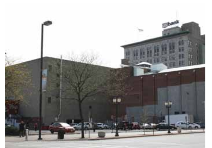
Photograph #10: View from the intersection of 1<sup>st</sup> Avenue and the Cedar River Corridor Trail of the project site south from the Convention Center parcel.

Photograph #9: View from Cedar River Corridor Trail at approximately the mid-point of the parcel showing construction of the Cedar Rapids Convention Center across 1<sup>st</sup> Avenue from the propose project site.