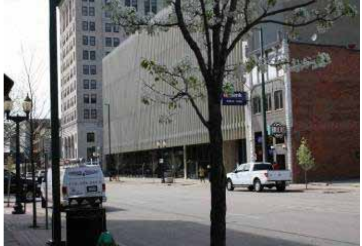
Photograph #1: View across 2<sup>nd</sup> Avenue of buildings facing on the road.