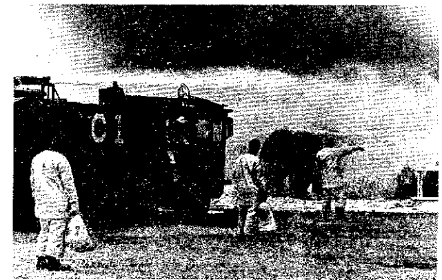
Members of the 190th participated in a pit fire exercise, dousing flaming drums with 18,000 gallons of foam and water.

Until the base facilities are consolidated, the primary responsibility