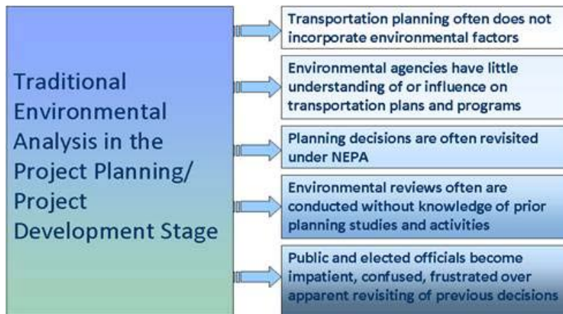
Figure 1: Traditional Environmental Analysis

The NEPA project development process is intended to inform the public and help Federal officials make decisions based on an understanding of the environmental consequences of a proposed action, and take actions that protect, restore, and enhance our environment. 7 NEPA analysis typically adds more specificity and technical information to State and local planning-level analyses, but the goal is the Federal NEPA review will not unnecessarily revisit these analyses and decisions. Revisiting of planning analyses and decisions often results from a need to develop or document information during NEPA that should more appropriately have been developed and documented during planning. When this occurs, it results in a duplication of work, more expense, confusion for the public and policymakers, and a potential delay in project implementation (see Figure 1 below). 8