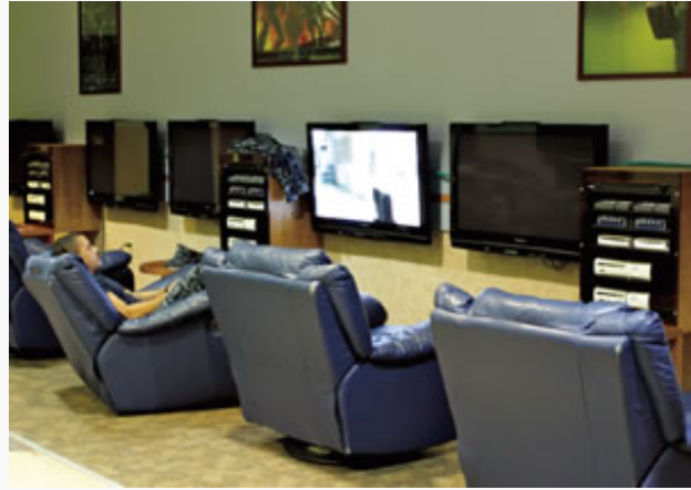
The Liberty Program provides activities for single Sailors and Airmen.