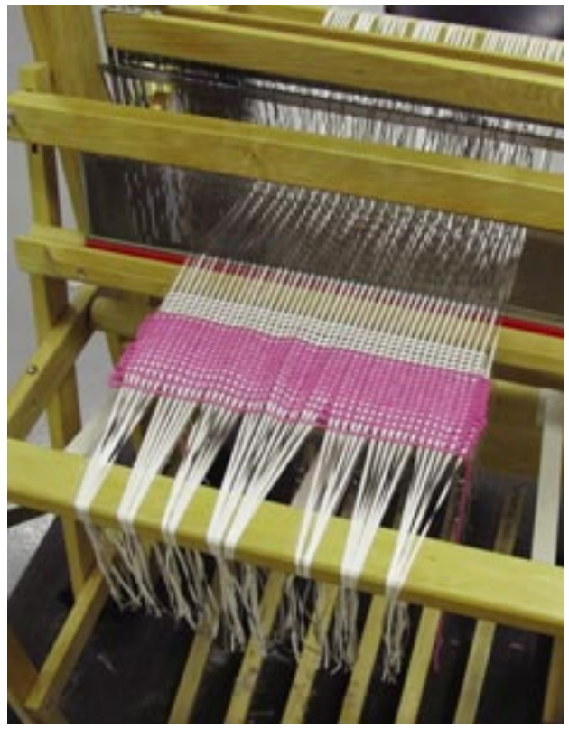
Weaving process for the new PVA parachute prototype. Andrew Strzepek