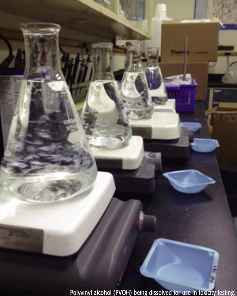
Polyvinyl alcohol (PVOH) being dissolved for use in toxicity testing. Brandon Swope