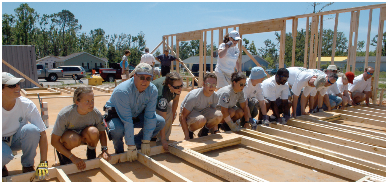
Gulfport, Miss., April 27, 2006 - AmeriCorps NCCC partnering with Harrison County Habitat for Humanity to build bunkhouses for volunteers assisting in recovery efforts on the Gulf Coast.