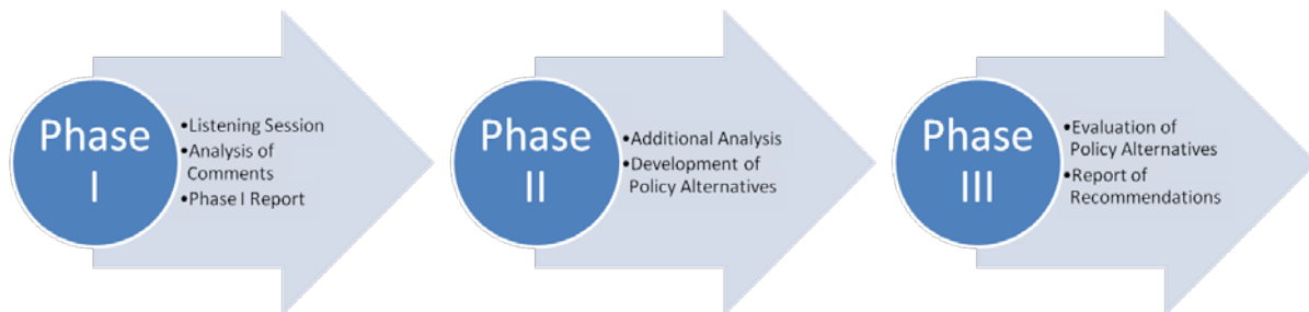
Figure 1. NFIP Reform Process

In performing its mission, the Federal Emergency Management Agency (FEMA) believes it is important to continually seek input from its many stakeholders on how its programs can be more efficient and effective at meeting the needs of the public. To this end, FEMA has engaged in a comprehensive reform effort to address the concerns of the wide array of stakeholders involved in the ongoing debate about the National Flood Insurance Program (NFIP). The effort is comprised of three phases designed to engage the greatest number of stakeholders and consider the largest breadth of public policy options. Phase I focuses on the capture and analysis of stakeholder concerns and recommendations. During the second Phase, FEMA will perform additional analysis of existing data and develop a portfolio of public policy alternatives. In Phase III the public policy alternatives will be evaluated using a standard set of criteria and the resulting recommendations will be reported (see Figure 1 below for a graphical outline of this process).