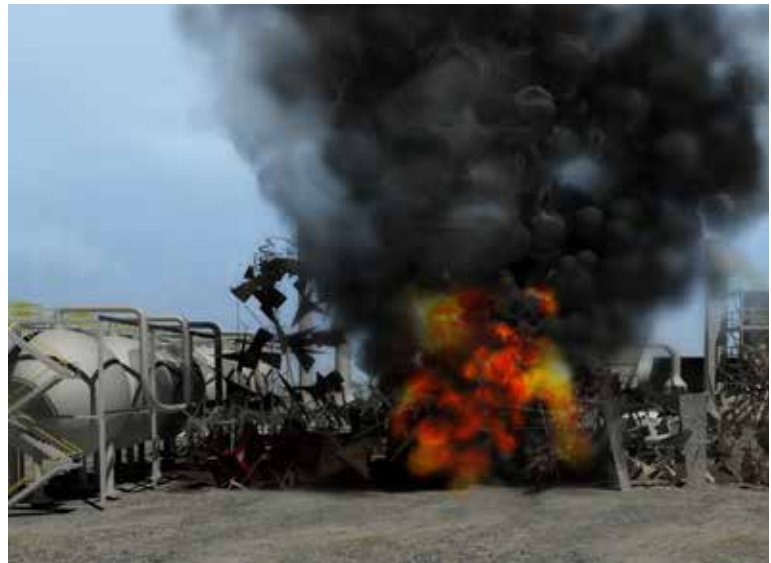
Graphic scene of a facility undergoing destruction and possible loss of life due to a violent explosion.

Dr. Poludnenko and his team are studying whether or not a controlled burn (known as deflagration) can lead to a detonation, what is known as the deflagration-to-detonation transition or DDT. Understanding this transition has crucial applications to the safety of fuel storage facilities and chemical plants. Knowing how to harness DDT also promises to revolutionize propulsion systems by introducing detonation engines. Dr. Poludnenko models unconfined DDT on ARFL's Supercomputer SPIRIT located at Wright-Patterson AFB. Using thirty-two thousand cores on SPIRIT, he is developing numerical simulations which reveal that turbulent flames in unconfined media can become fast enough to produce detonations.