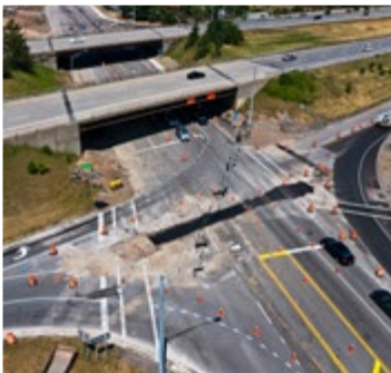
◀ Feedback has been positive from drivers trying New York's new diverging diamond interchange in suburban Rochester.

A report on the innovations used and lessons learned on the New York Highways for LIFE project is available at www.fhwa.dot.gov/hfl/summary/projects_summary.cfm .