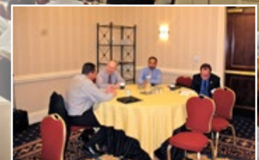
Representatives of highway agencies in the Mid-Atlantic states convened in Baltimore to learn about Every Day Counts strategies to shorten project delivery.