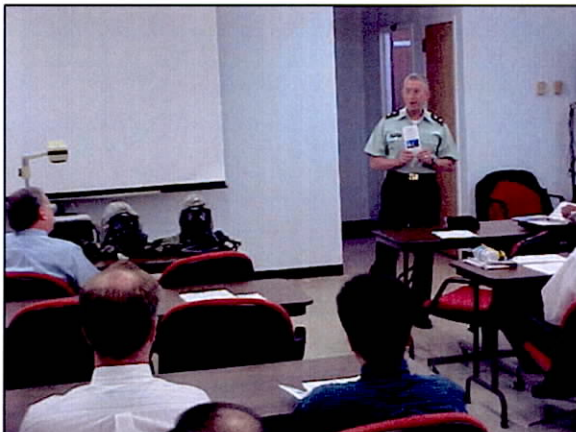
Senior leadership conducts VE workshop to improve the enterprise value proposition.

This goal can be accomplished through broad and rigorous application of the VE methodology