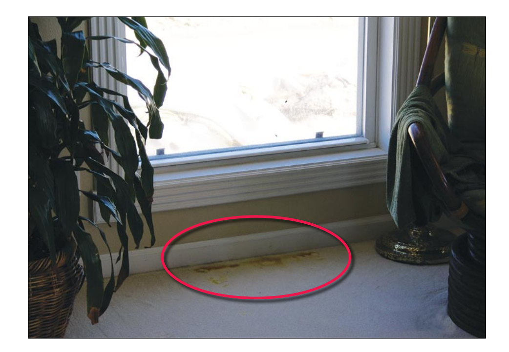
Figure 7-2. Several windows at this house on Bolivar Peninsula leaked and wetted the carpet

The MAT observed a house under construction on Bolivar Peninsula (Figure 7-3) that had protected glazing in a breakaway wall. The breakaway walls and the window were destroyed by flooding. Currently, if a building is in a windborne debris region, ASCE 7, IBC, and IRC require protected glazing, including the glazing in breakaway walls. However, if the walls break away because of flooding, the windows will likely be destroyed as shown in the inset in Figure 7-3.