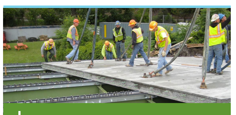
UHPC connection details make using prefabricated bridge elements simpler and more effective for accelerated bridge construction.

UHPC is a steel fiber-reinforced, portland cement-based, advanced composite material that delivers performance far exceeding conventional concrete. As UHPC performance exceeds that normally predicted from a field-cast connection, it allows the behavior of the joined prefabricated components to surpass that of conventional construction.