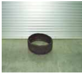
Figure 5. Photo. Tire tread.