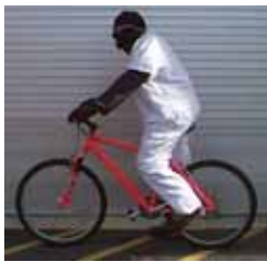
Figure 4. Photo. Cyclist in white clothing.