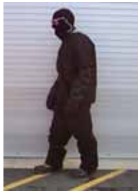
Figure 1. Photo. Pedestrian in black clothing.