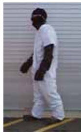
Figure 2. Photo. Pedestrian in white clothing.