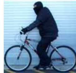
Figure 3. Photo. Cyclist in black clothing.