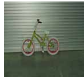
Figure 6. Photo. Child's bicycle.