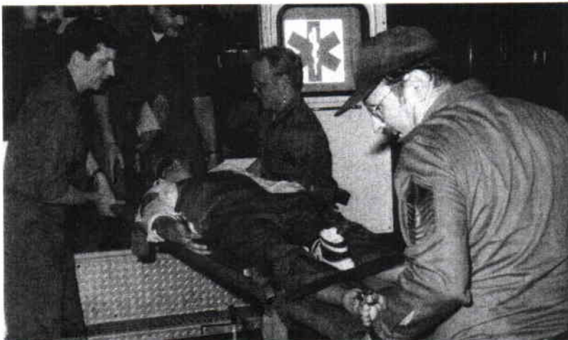
Staff members at Wiesbaden regularly participate in mass casualty exercises, honing their skills to deal with serious catastrophes on short notice.