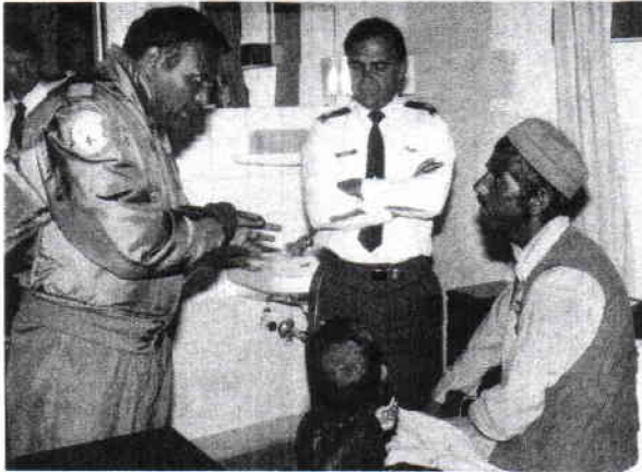
A member of MAC's 2nd Aeromedical Evacuation Squadron speaks with one of 25 Afghan civilians transported to the 7100 CSW Medical Center, Weisbaden, Germany, May 9-11, 1986, to receive specialized treatment for war-related injuries.

by the U.S. Army, efforts were made to evacuate German patients to other hospitals. This was accomplished by the end of May 1945 (1).