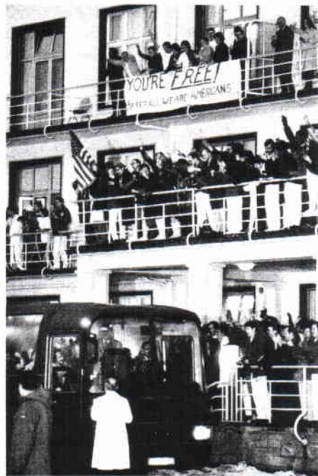
The 52 hostages released from Iran received a warm welcome and many cheers as they arrived at Wiesbaden on Jan. 21, 1981. They stayed at the hospital for a few days before leaving for the United States.

When 52 patients arrived from Teheran, Iran, on Jan. 21, 1981, they were assigned to various wards in the hospital or discharged. None of the patients already in the hospital were transferred to other facilities, and basic