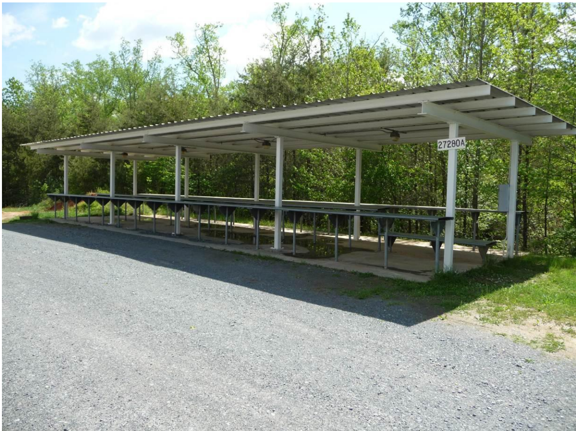
Weapons Cleaning Area.