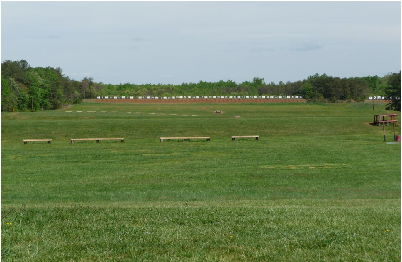
Range 3 600 yard line.

TARGETS/SIMULATORS/DEVICES. Moving/turning target system installed at protective berm. Targets on Range 3 will be placed in the target carriages for KD firing. For short range shooting the targets will be placed to ensure projectiles do not impact the protective berm. Targets are limited to ballistic steel, paper, wood and plastic.