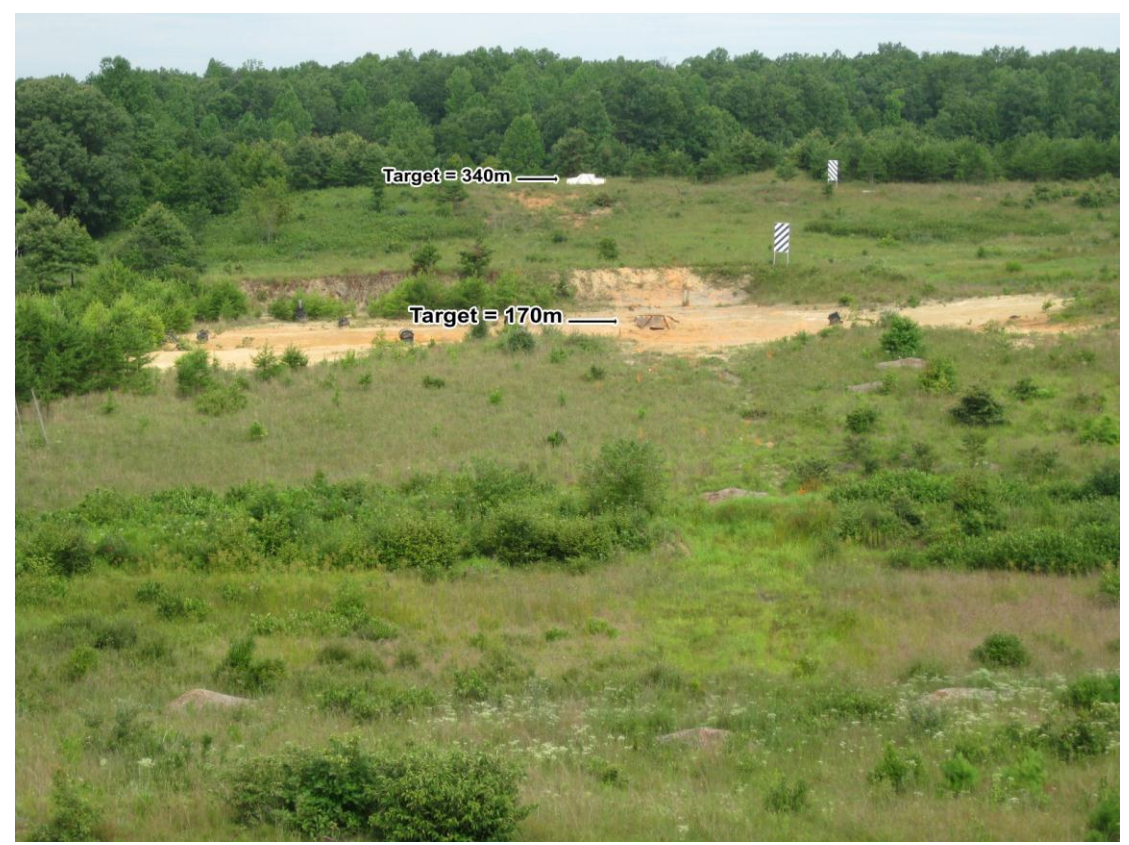
Bay 1 Targetry.