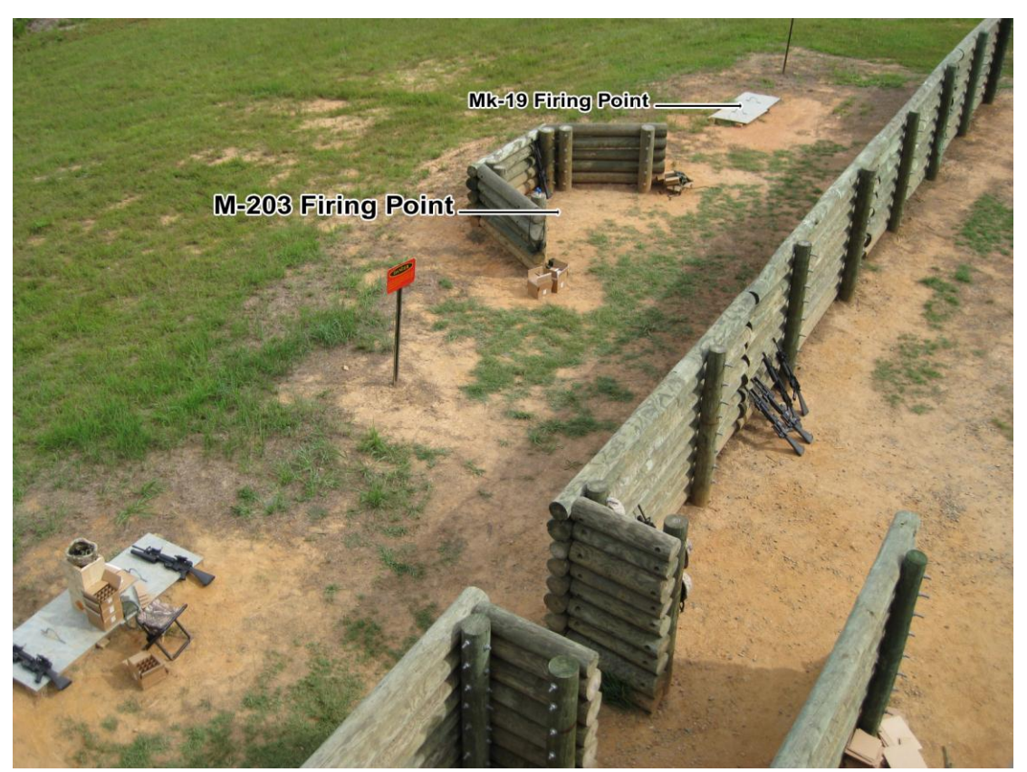
Bay 1 from tower.