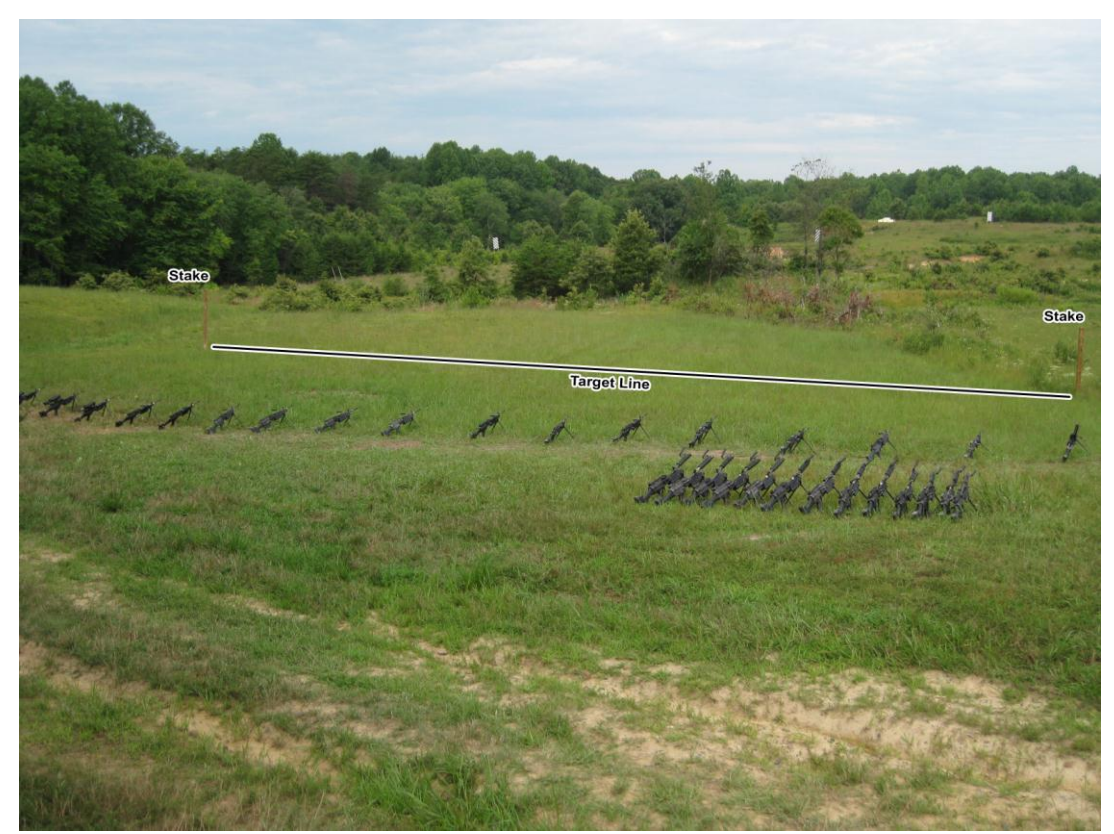
Bay 2 Firing line.