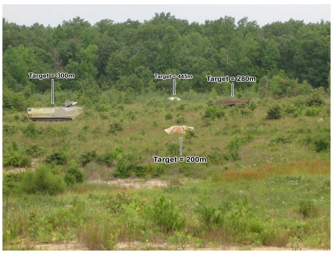
Bay 4 targetry.