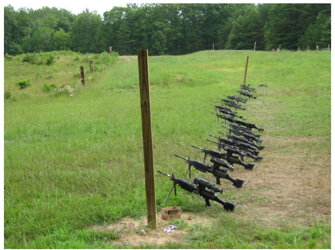
Bay 2 Firing line.