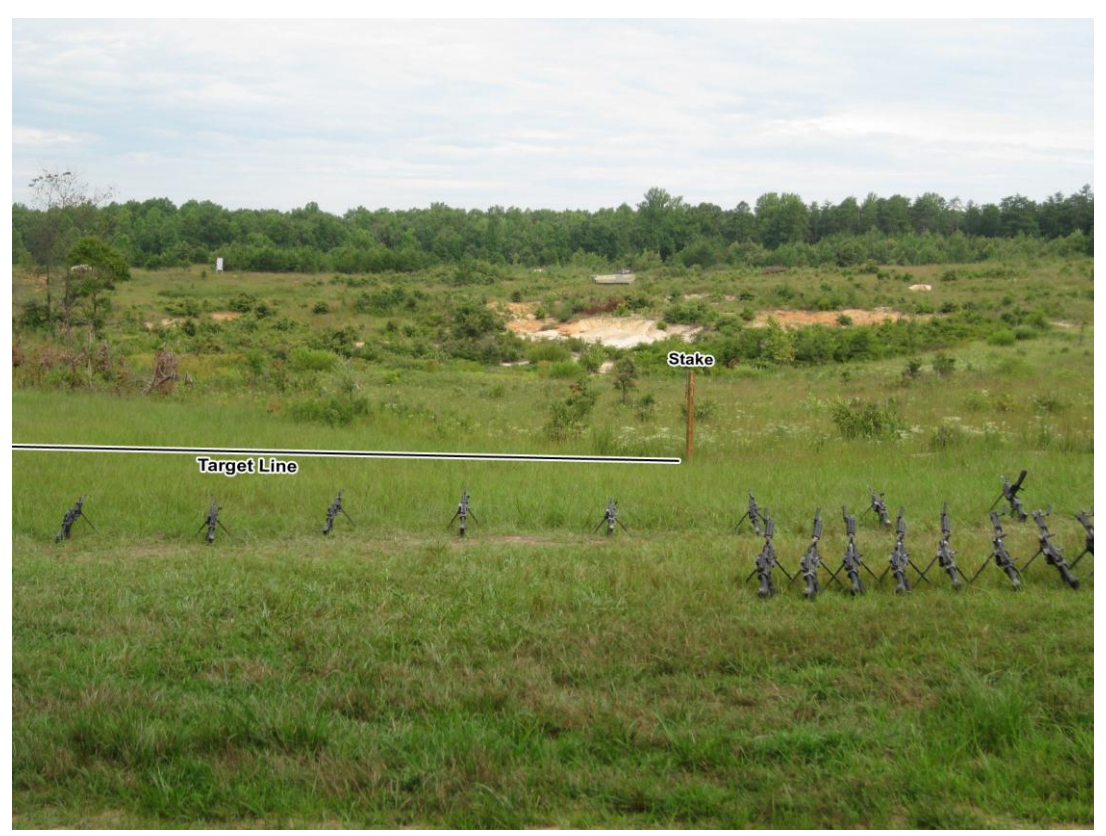
Bay 2 Firing line.