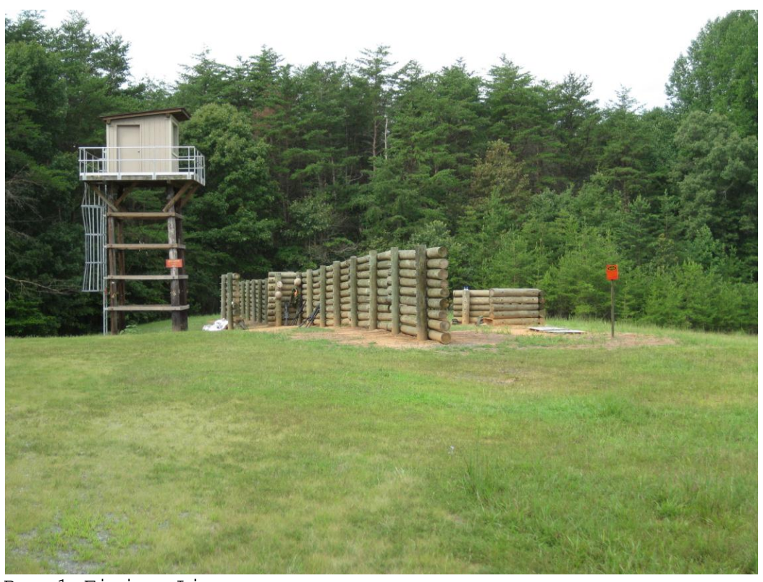
Bay 1 Firing Line.