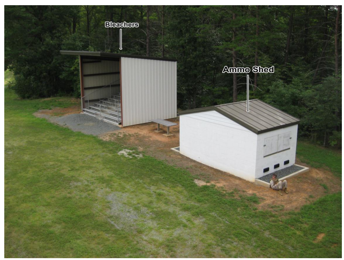
Bay 1 bleachers and ammo shed.