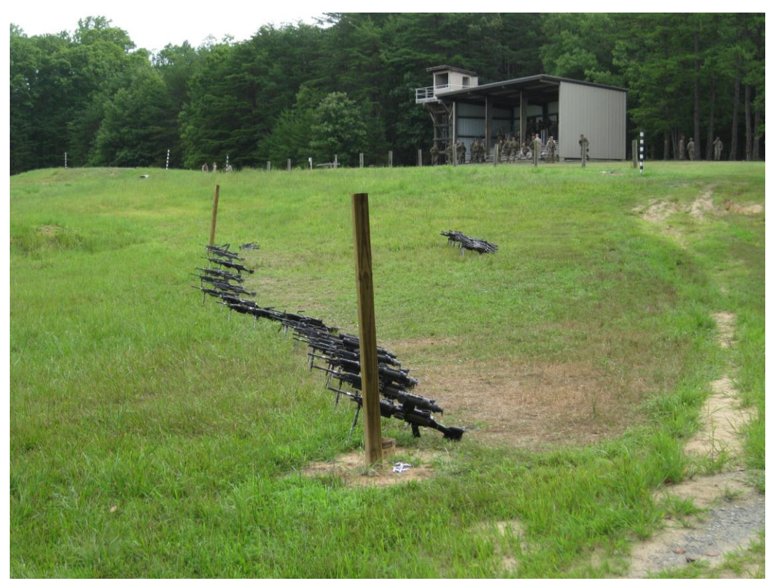
Bay 2 Firing line.