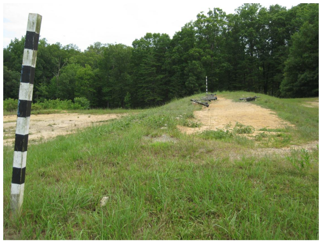
Bay 4 Firing line.