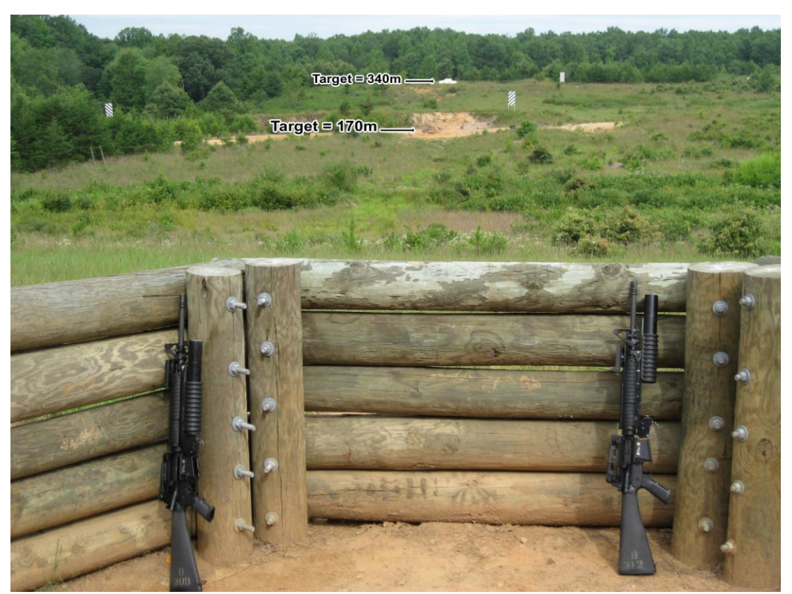
Bay 1 Targetry.