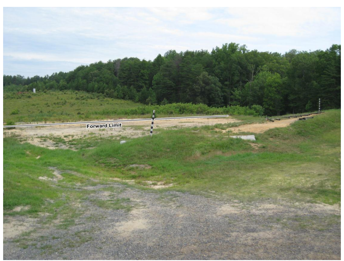
Bay 4 Firing line