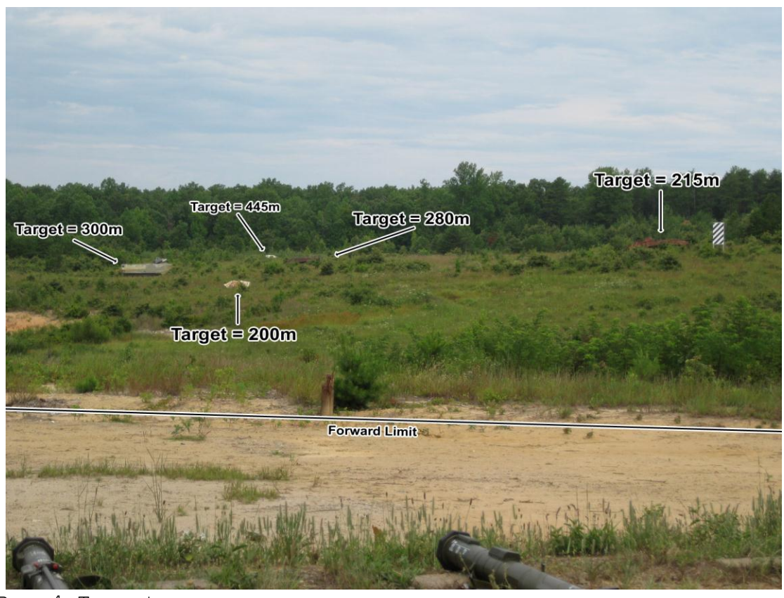
Bay 4 Targetry.

Targets: Multiple EODT and vehicle hulks (min range-200m, max range-445m)