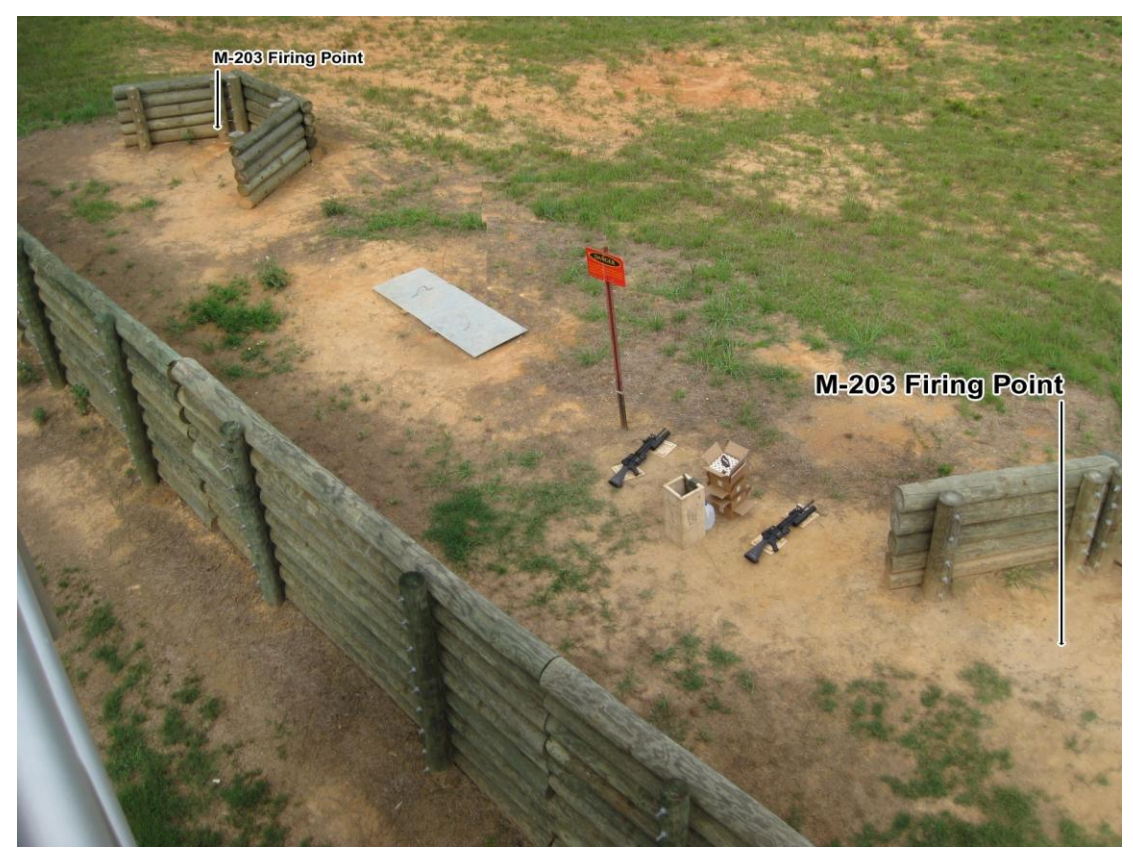
Bay 1 from tower.