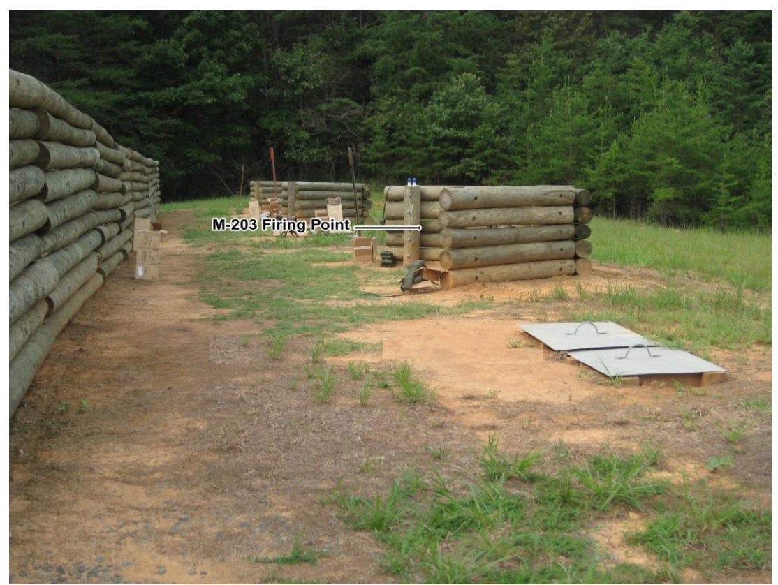
Bay 1 Firing Line.