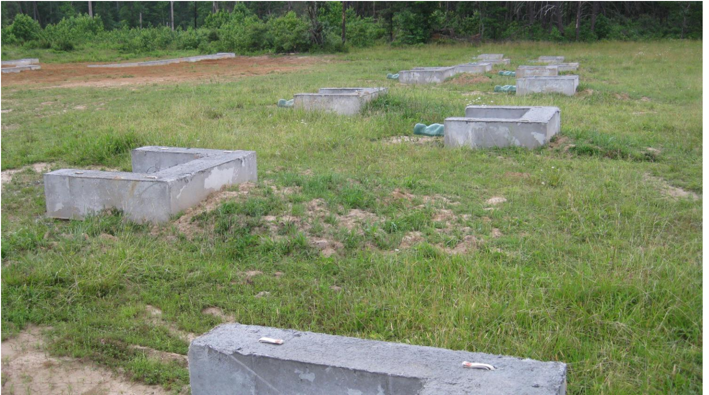
R14D MOVERS AND BUNKER