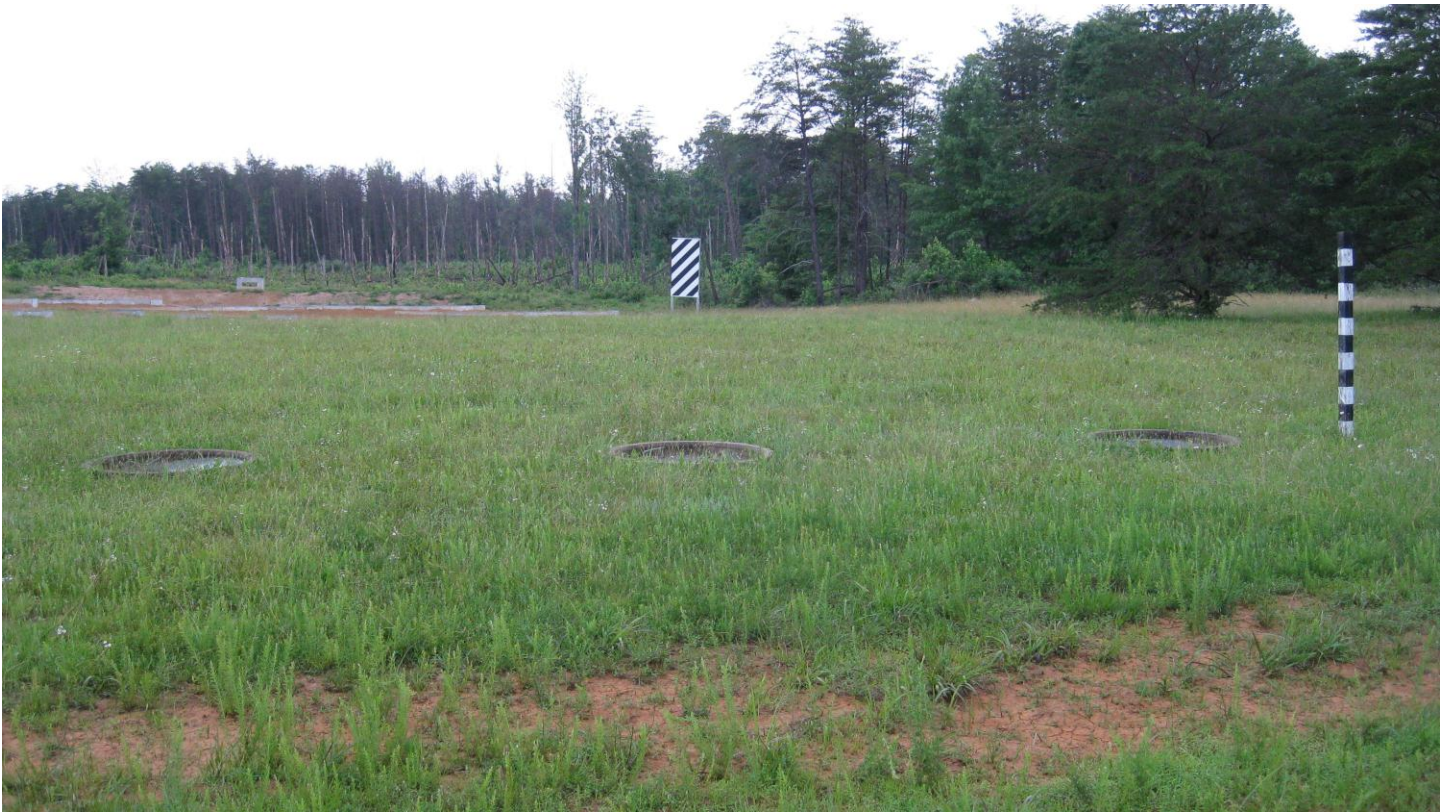
R14D LEFT LAT LIMIT