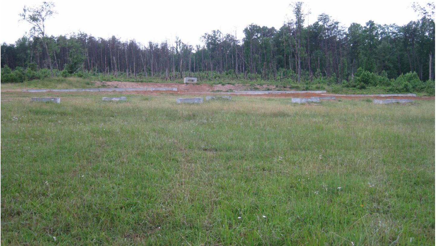
R14D COFFIN TARGETS