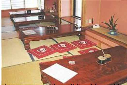
A restaurant with traditional low tables

In Japan, some restaurants and private houses are equipped with low Japanese style tables and cushions on the floor, rather than with Western Style chairs and tables.