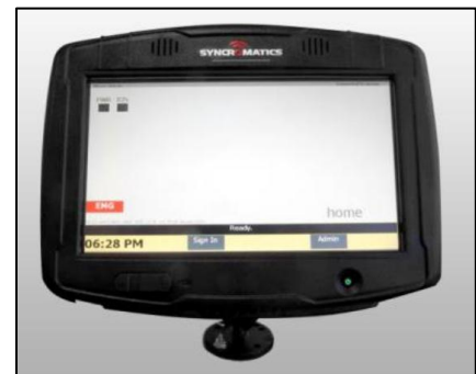
Mobile Data Terminals are an example of smart technology investments that can feed into a comprehensive urban analytics system

Another idea we would like to pursue builds off of the fact that the City of Shreveport literally has eyes and ears everywhere – city employees who could easily transmit data about events and incidents if there was a technology platform that would support information flows without breaking the bank. Currently, information about roadway debris, accidents, power outages or other events in Shreveport may be called in over a short-wave radio, but the process of getting this information into the right hands is inefficient. A “Civic Communications” system would ideally integrate with existing hardware used by different departments for ongoing data collection, but would result in a back-end messaging system that would get specific data to targeted end users. For example, a bus operator could hit a pre-set icon on the bus’s Mobile Data Terminal/Global Positioning System to send map-based alerts for “excessive litter” to a public works team. Or police responding to the scene of an accident could feed data back into the regional traffic management system and public traffic displays through laptops that are installed on all vehicles. This type of system would have clear benefits for transportation systems by getting information out faster, but the impacts would spill over into other sectors and improve the overall efficiency of government services.