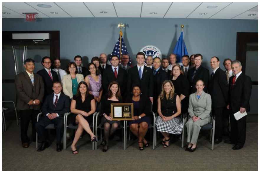
2012 ICE Director’s DHS Partner Award recipients.

Throughout 2011, CRCL and ICE ERO collaborated in creating the first two Secure Communities educational and awareness videos in a series of eight, and revamped the Secure Communities website to better highlight and emphasize DHS and CRCL/ICE-related activities. CRCL and ERO also worked diligently to launch a proactive quarterly review of law enforcement statistics related to Secure Communities interoperability to identify and, if necessary, respond to civil rights problems, including improper policing activities such as racial or ethnic profiling on the part of state or local law enforcement agencies in which Secure Communities interoperability has been activated.