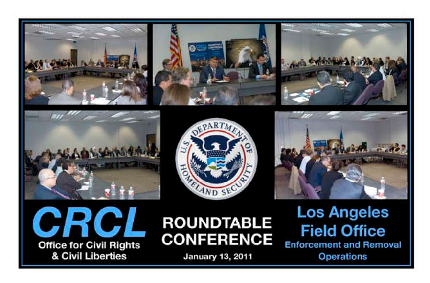
Los Angeles Roundtable Flier

This is first of several expanded roundtables that CRCL will lead in coming months throughout the country. Visit the CRCL Community Engagement Section to learn more about CRCL's outreach programs.