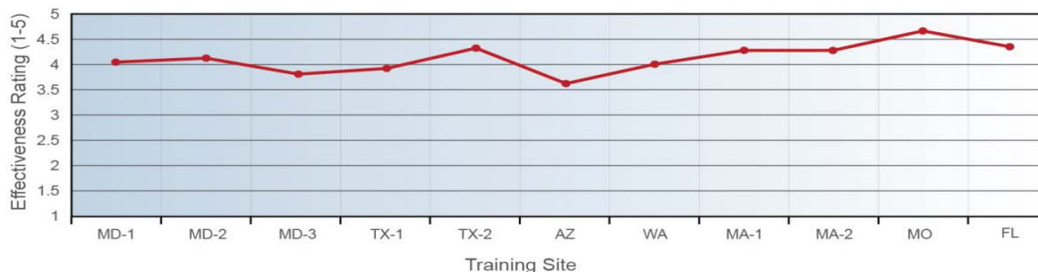
Rating of Overall Content Effectiveness of CRCL Fusion Center Training, FY 2009

Civil Liberties and Privacy Web Portal. DHS identified a clear need for a single online “roadmap” to all the Federal materials on civil rights and civil liberties issues and resources and the Information Sharing Environment (ISE). To address this need, CRCL and the Privacy Office partnered with the DOJ Bureau of Justice Assistance and the Global Justice Information Sharing Initiative to launch a basic web portal to federal privacy, civil rights, and civil liberties resources in FY 2009.