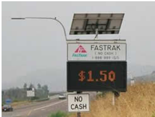
(Picture showing “FastTrak” toll of $1.50, and indicating a “no cash” (i.e., all electronic) collection method)

Congestion is recognized to be a growing problem, particularly in American urban areas. The U.S. has close to four million miles of roads, bridges, and highways to support a wide variety of economic and social activity. However, over time the demands on this infrastructure have outstripped its capacity. While the miles of urban roadways built have increased by nearly 65 percent since 1980, vehicle miles traveled on urban roadways increased by about 150 percent. As a result, traffic in most metropolitan areas has become increasingly congested, costing both time and fuel.