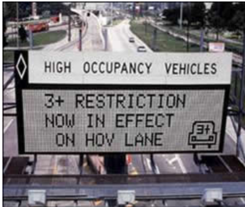
(Picture displaying a sign reading “HOVs – 3+ Restriction Now In Effect on HOV Lane”)

HOV facilities offer States the ability to match vehicle eligibility criteria and vehicle occupancy requirements to the demand for the lane. Under 23 U.S.C. 166 (a), the States retain the authority to establish the minimum occupancy requirements of their HOV lanes, so long as the minimum occupancy is no less than two. The goal is to set the occupancy requirement at a level that will encourage the use of carpooling, vanpooling, and transit services without overloading the capacity of the HOV lane.