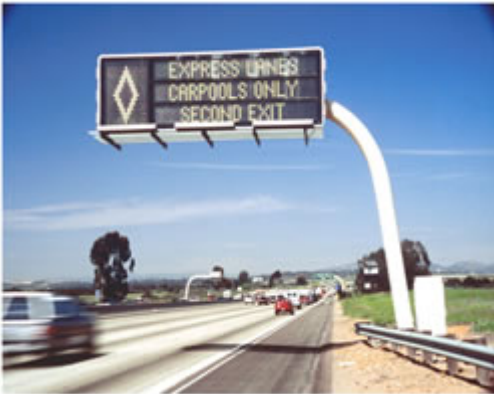
(Picture displaying overhead sign reading “Express Lanes Carpools Only Second Exit”)

lane - automatic tolling, dynamic tolls that vary with the level of congestion, adequate enforcement, and ongoing performance monitoring, evaluation, and reporting and modification of operations when approaching degraded conditions. The toll amount should be varied based on historical highway use and/or real-time traffic conditions. Chapter IV provides the definition of a degraded HOV lane.