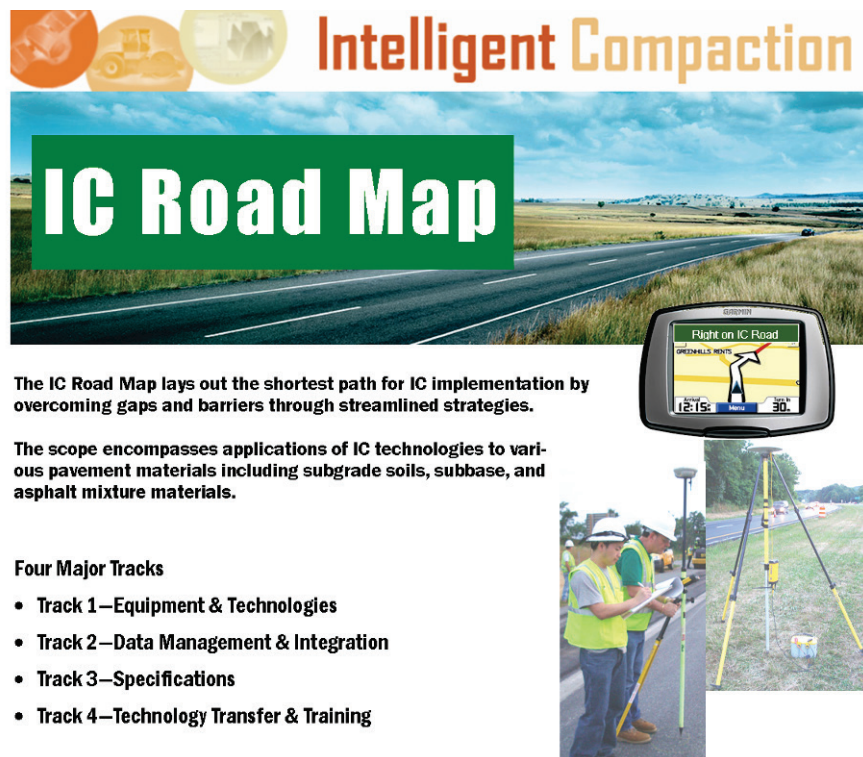
Figure 1. The Intelligent Compaction Road Map (Transtec Group)

The FHWA/TPF project, led by the Transtec Group, also developed an IC Road Map that addresses the gaps and barriers for implementation that includes four major tracks: (1) Equipment and Technologies, (2) Data Management and Integration, (3) Specifications, and (4) Technology Transfer and Training (see Figure 1). An extensive knowledge base was built from those field demonstrations and is readily available to the public via the IC website ( www.intelligentcompaction.com ), also developed and maintained by the Transtec Group. The IC National Workshops under the FHWA TOPR No. 5 (DTFH61-10-D-00027) are intended to address key elements of the IC Road Map.