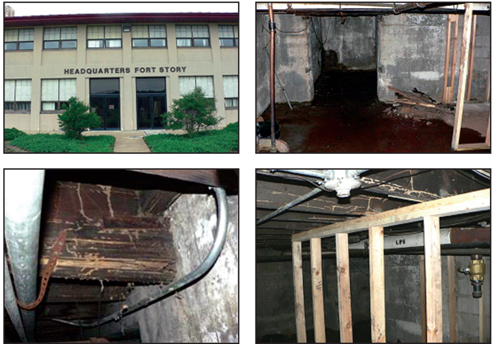
Figure 2: Damaged Basement in the Command Headquarters Building at Fort Story