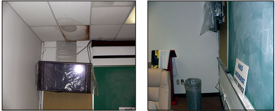
Figure 5: Damage from a Leaking Roof at the Public Works Building at Naval Air Engineering Station Lakehurst