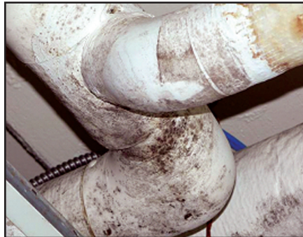
Figure 4: Leaking Pipes Caused Mold and Mildew Damage at Naval Amphibious Base Little Creek