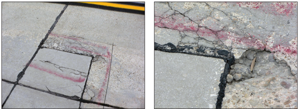
Figure 7: Cracking Aircraft Aprons at Randolph Air Force Base