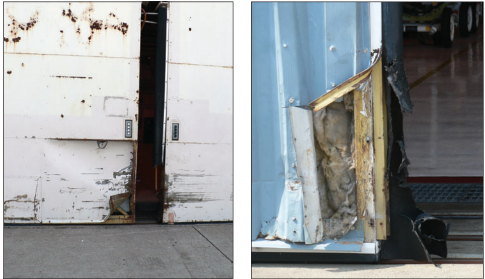
Figure 5: Damaged Aircraft Hangar Doors at Oceana Naval Air Station