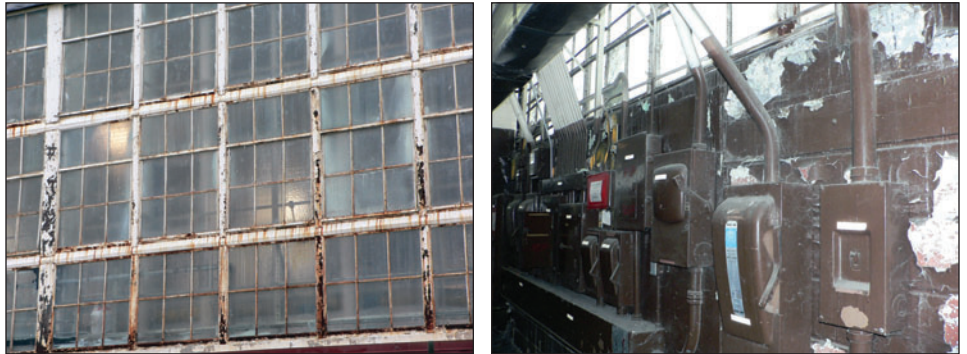
Figure 6: Leaking Windows and Electrical Panels that Created a Safety Hazard at a Deteriorated Aircraft Maintenance Hangar on Randolph Air Force Base