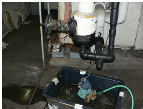
Figure 2: Leaking Pipes and Cracked Walls at a Damaged Warehouse Facility at Fort Sam Houston

At the eight installations we visited, facility sustainment requirements were not fully funded every year during fiscal years 2005, 2006, and 2007. At some, but not all, of the installations, local officials stated that sustainment funding had not been available to accomplish all needed work and, as a result, many installation facilities were in a deteriorated condition. For example, officials at Fort Sam Houston stated that the foundation of a warehouse facility had shifted, which caused cracks in the walls, warped door frames, and leaking pipes (see fig. 2). Repairs had not been completed because adequate sustainment funds were unavailable. Fort Sam Houston officials also noted that several barracks buildings, which were still in use, had deteriorated because of inadequate funding. For example, porch surfaces were crumbling, paint was peeling, and windows needed repair (see fig. 3).