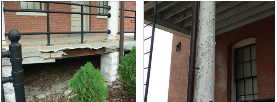
Figure 3: Deteriorated Barracks Building at Fort Sam Houston