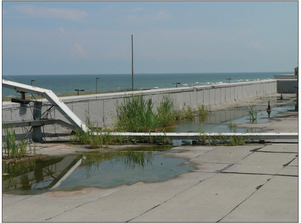
Figure 4: Standing Water on a Leaking Roof of a Weapons and Radar Training Building at an Oceana Naval Air Station Annex