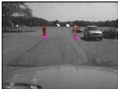
Visual output of the pedestrian-detection system as it recognizes crossing pedestrians.

IMPACT: Twilight hours are the most dangerous time for pedestrians. Existing detection systems, however, have limited effectiveness in low-light conditions. New approaches introduced in this study provide superior results in twilight.