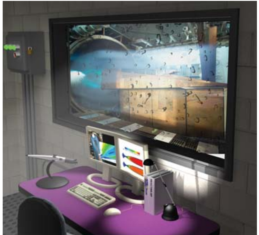
Graphic representation of a possible condensation event during a X51A engine test at a wind tunnel facility

During this process, oxygen is replenished and the resulting gaseous mixture contains high concentrations of water vapor. As the air velocity increases, it cools and causes condensation. This moisture affects the accuracy of probes and instruments. A CFD code, REACTMB-MP was developed specifically for the prediction and analysis of this phenomena and helps understand the phase changes during the ground test simulations.