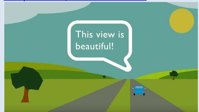
Screen capture from HEPR's Highway Beautification video