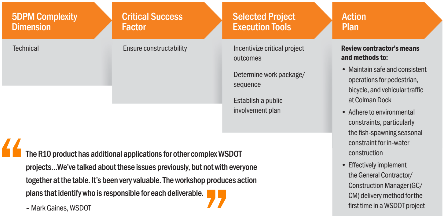
Figure 3 illustrates the development of one of WSDOT's 7 action plans.

“ The R10 product has additional applications for other complex WSDOT projects...We've talked about these issues previously, but not with everyone together at the table. It's been very valuable. The workshop produces action plans that identify who is responsible for each deliverable. ”