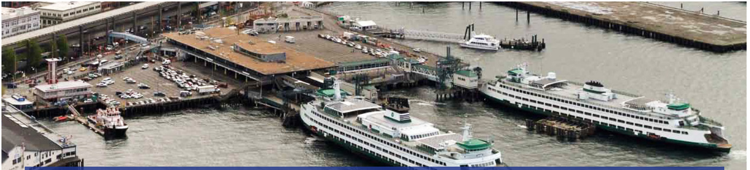
The Seattle Multimodal Ferry Terminal at Colman Dock